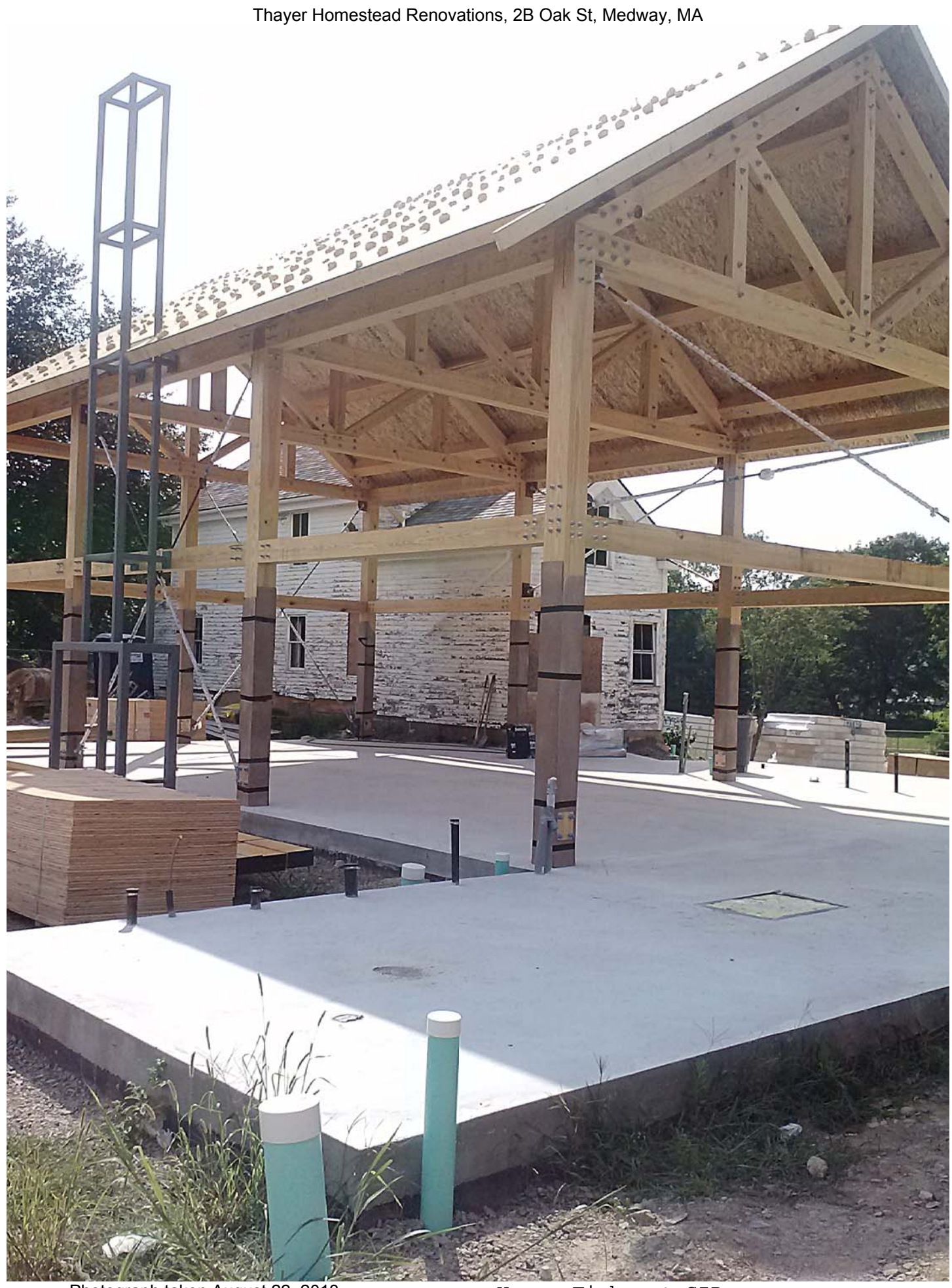
Photograph taken August 22, 2013