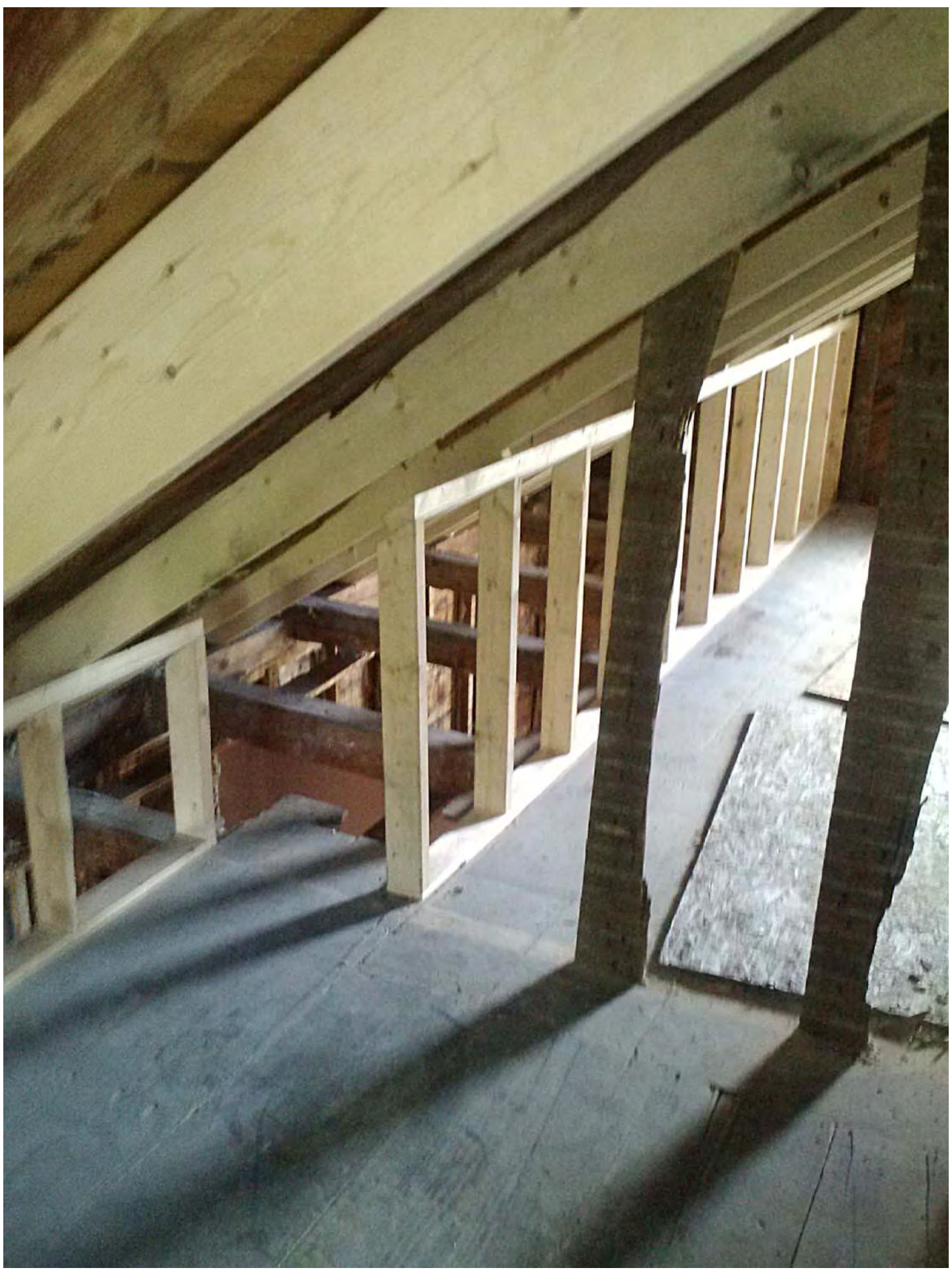
Photograph taken May 16, 2013