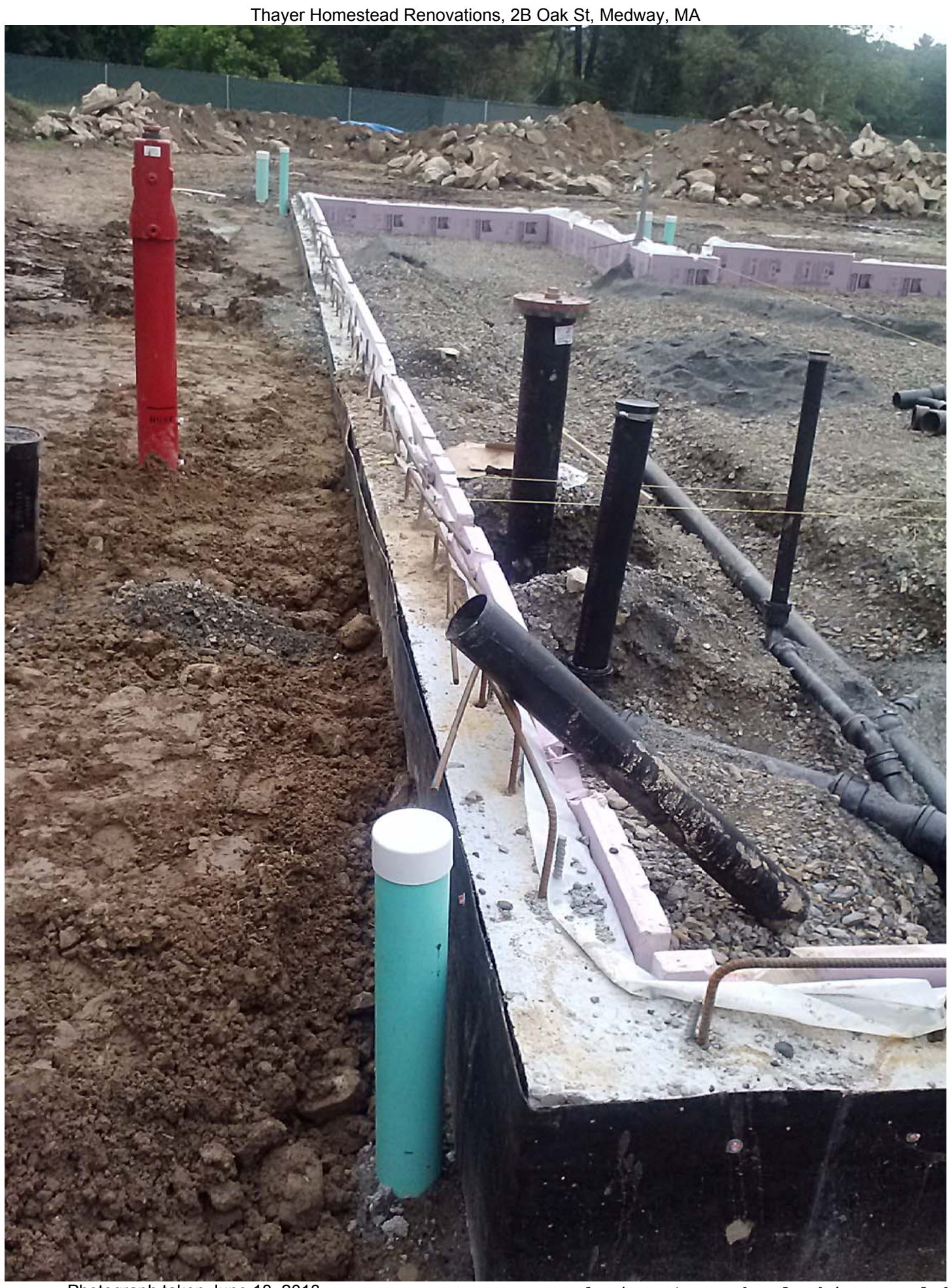
Photograph taken June 13, 2013