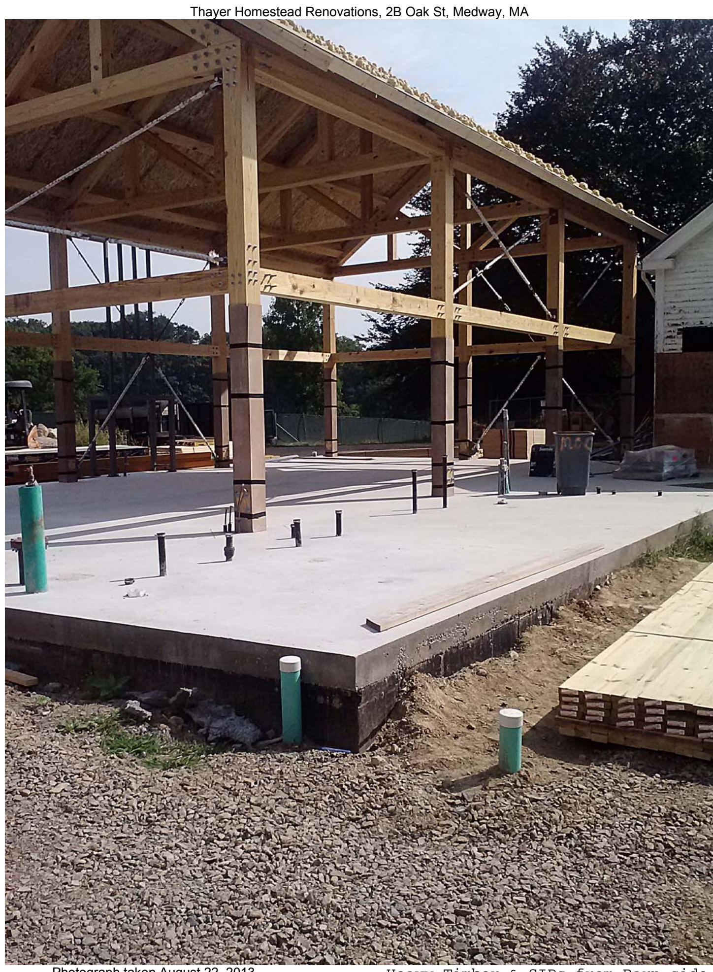
Photograph taken August 22, 2013