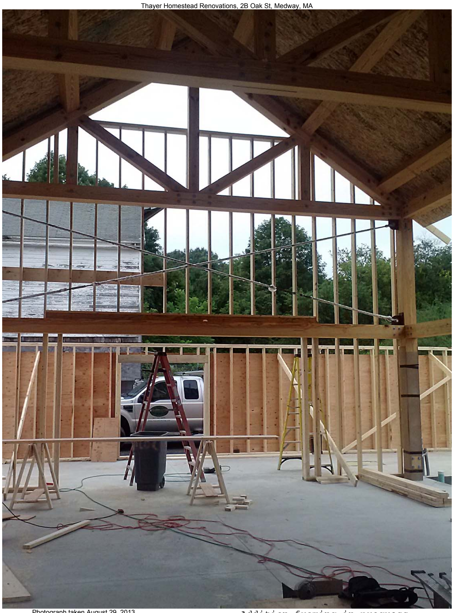
Photograph taken August 29, 2013