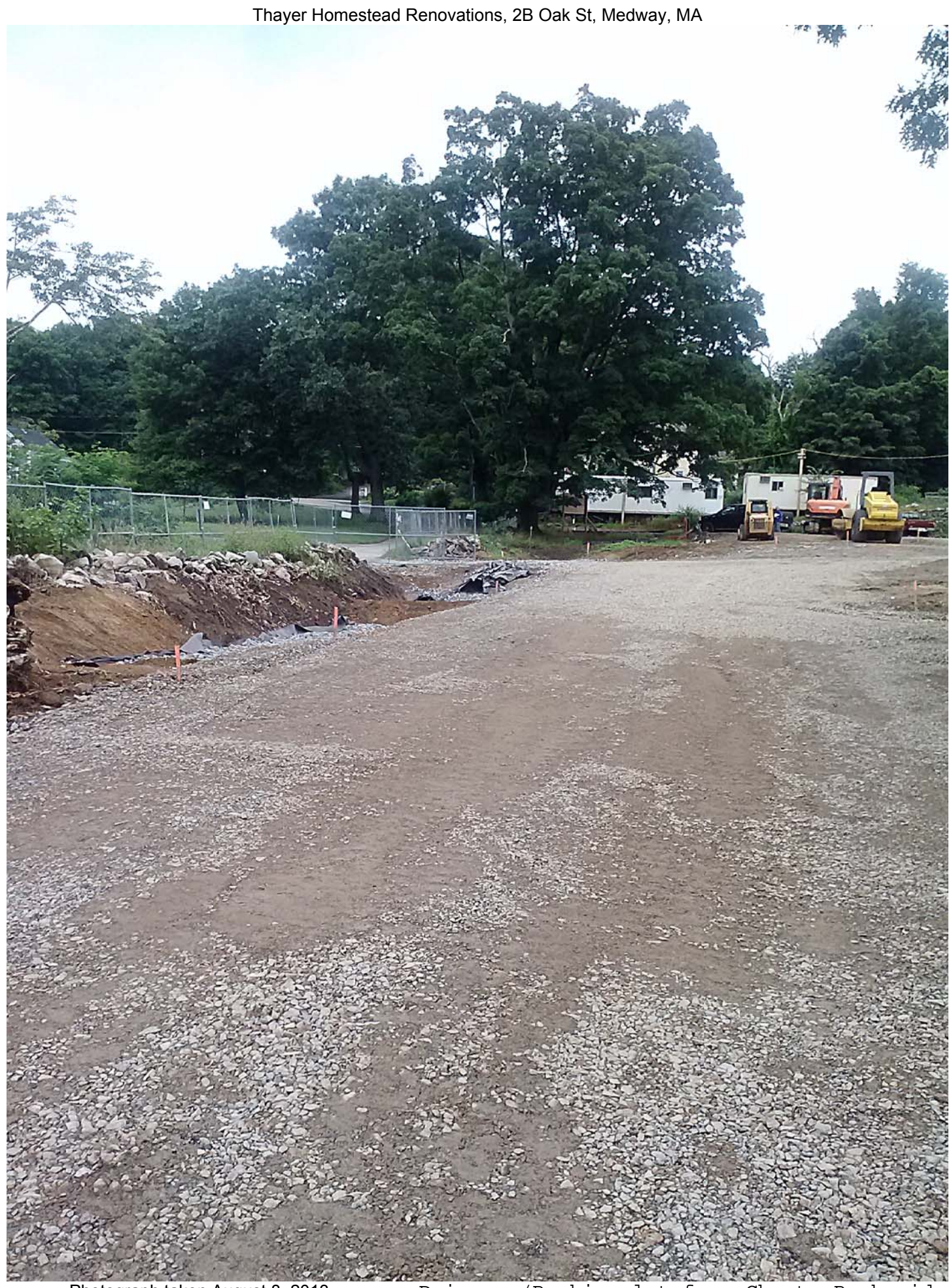
Photograph taken August 8, 2013