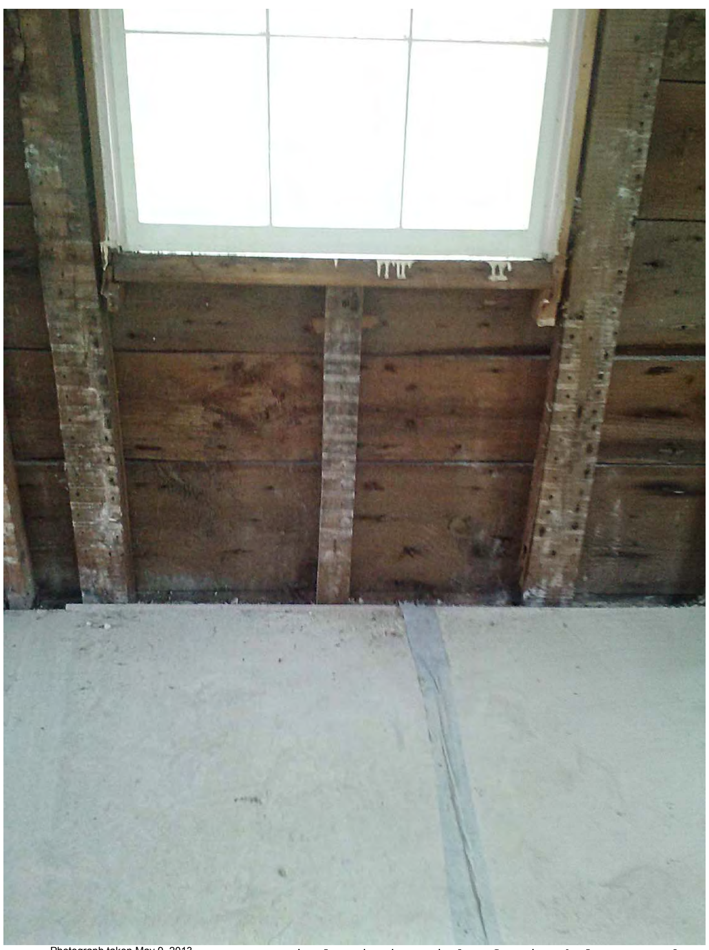
Photograph taken May 9, 2013