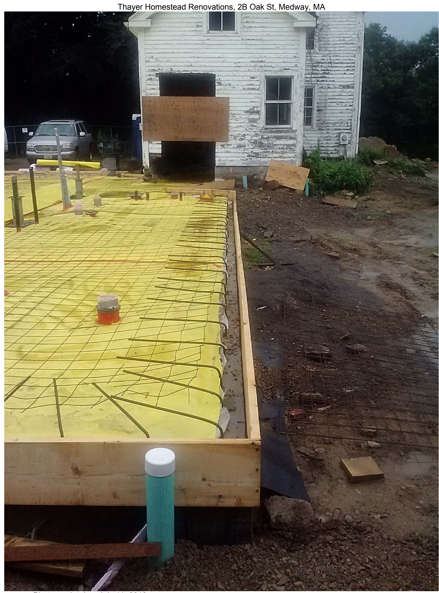
Photograph taken July 11, 2013