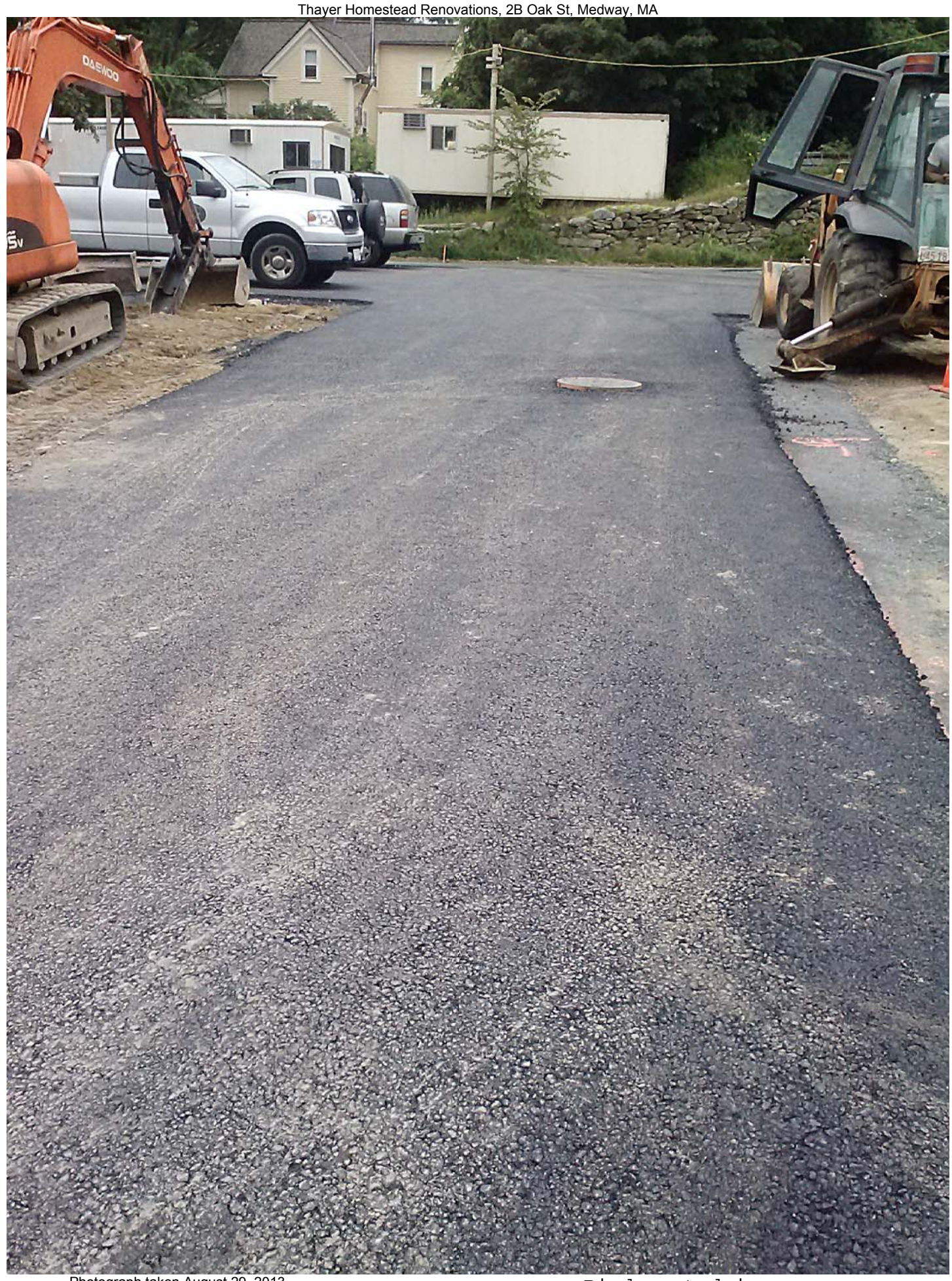
Photograph taken August 29, 2013