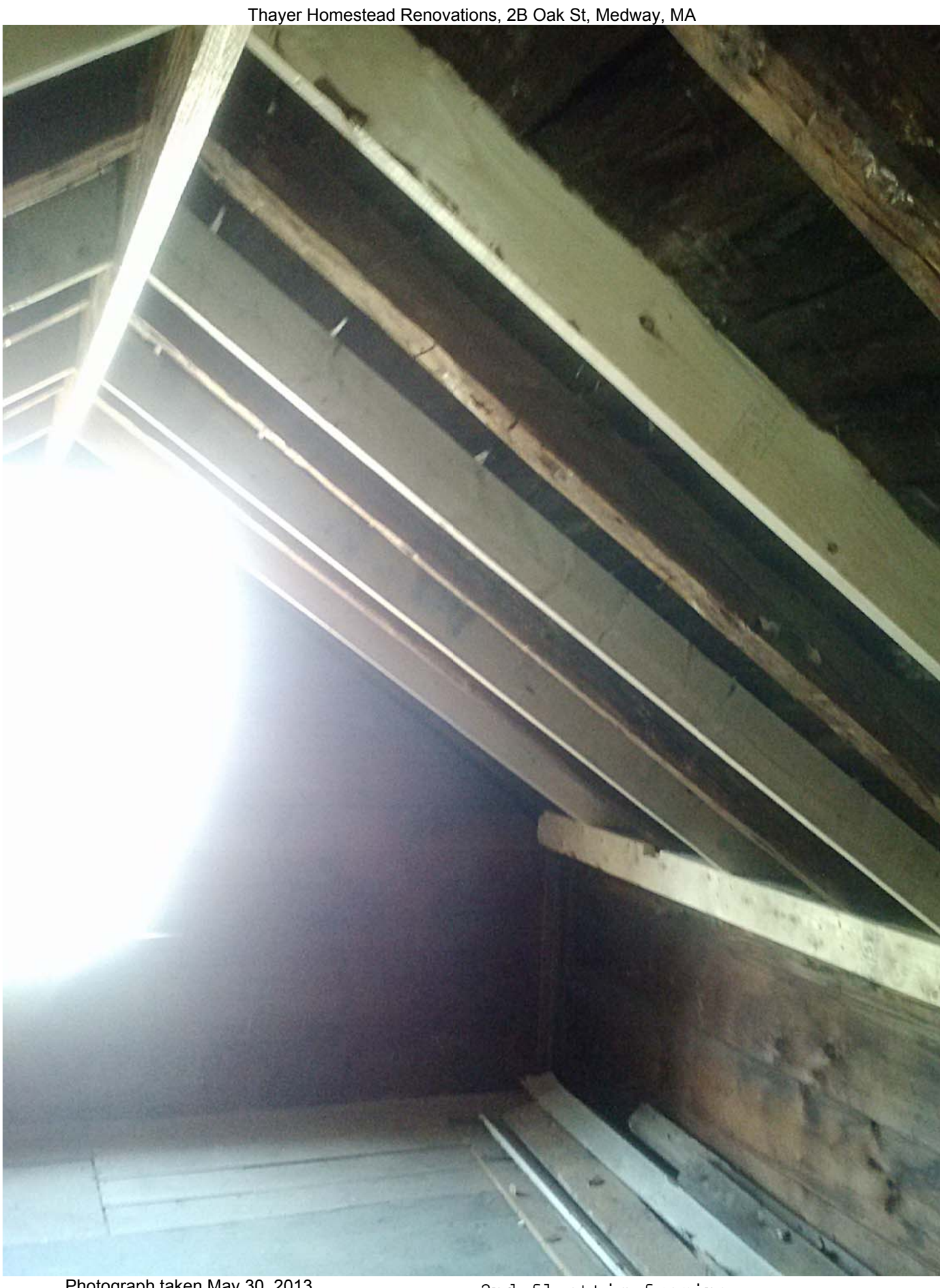
Photograph taken May 30, 2013