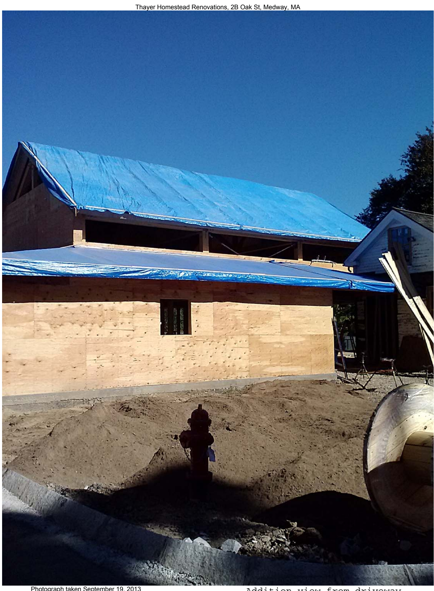
Photograph taken September 19, 2013