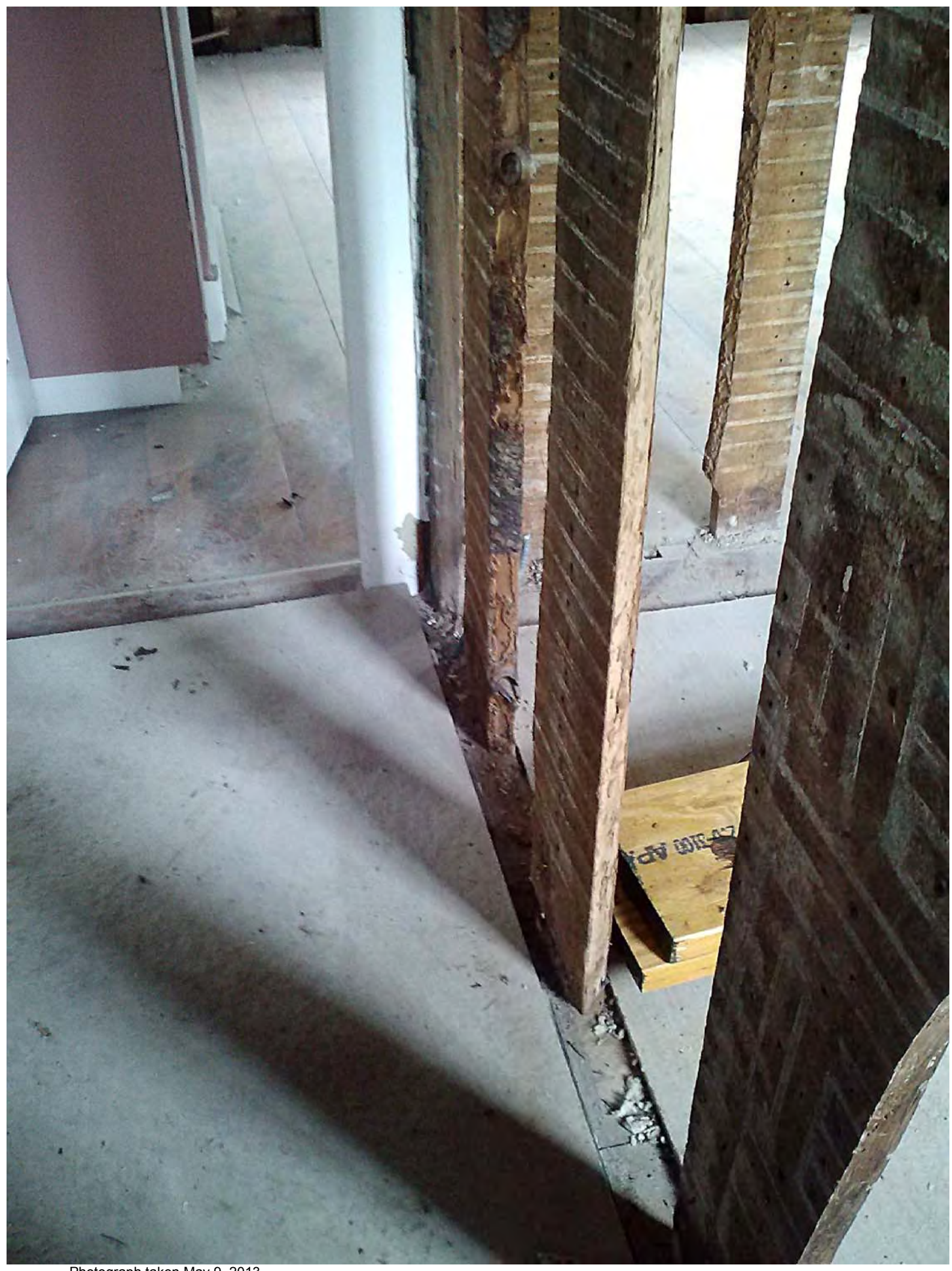
Photograph taken May 9, 2013 Existing framing between Kitchen 205 & Landing 200