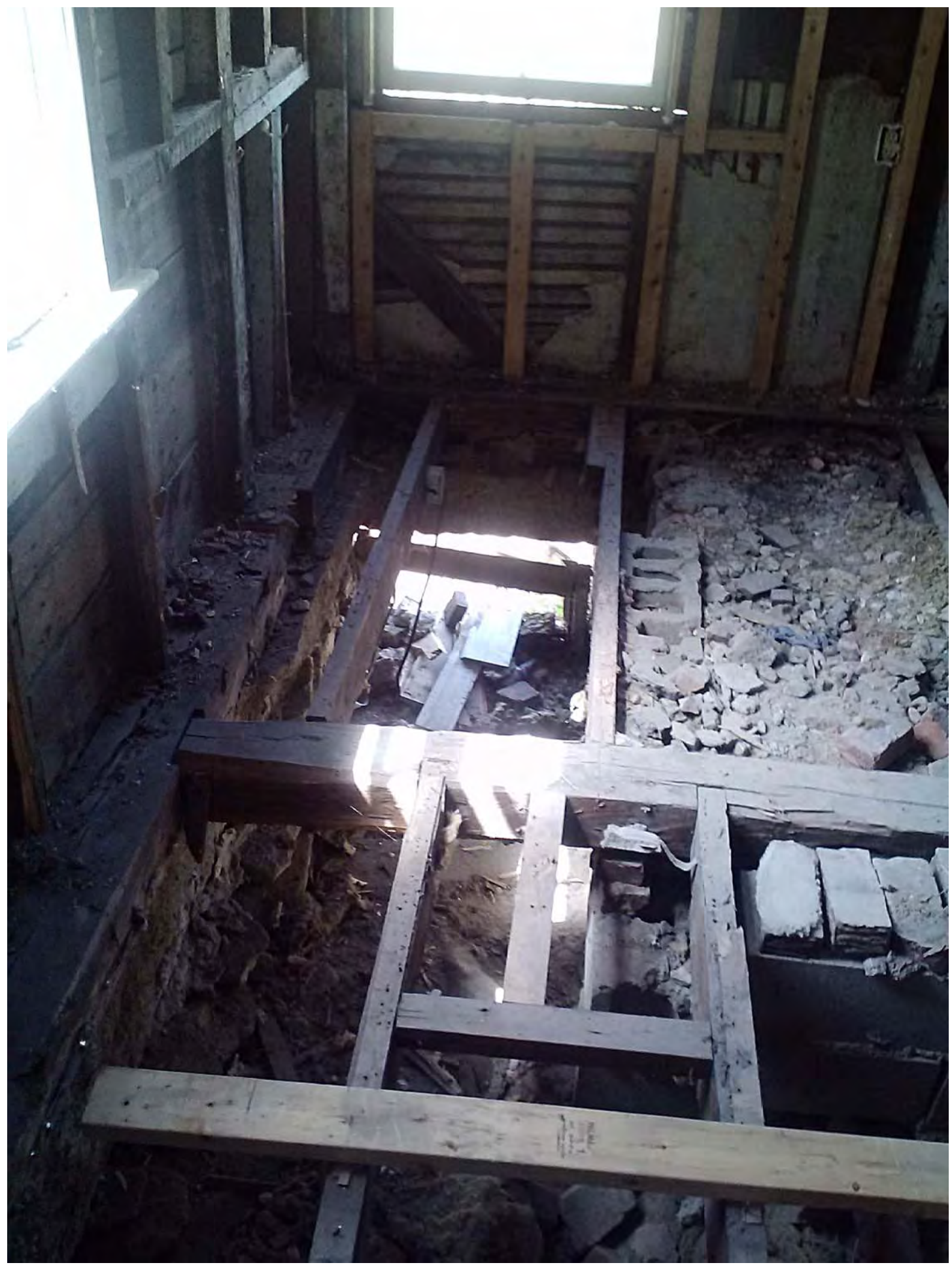
Photograph taken May 16, 2013