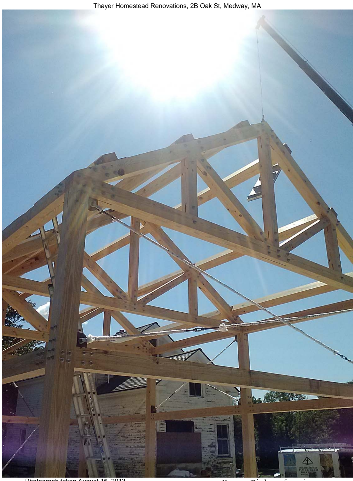
Photograph taken August 15, 2013