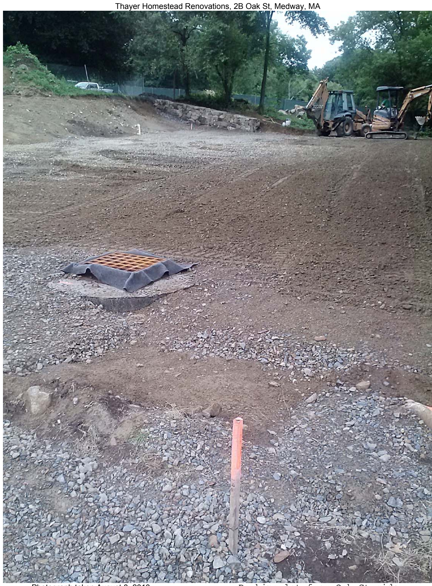
Photograph taken August 8, 2013