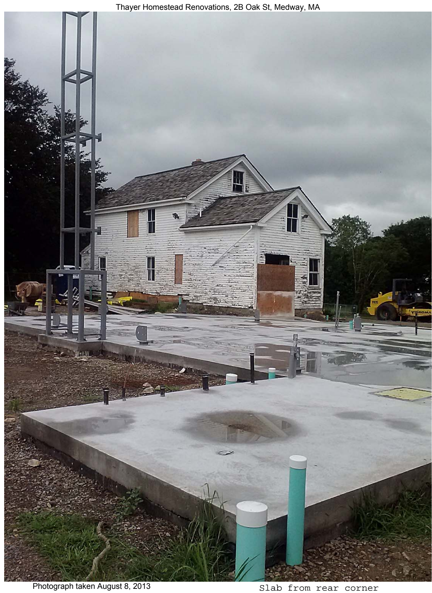
Slab from rear corner