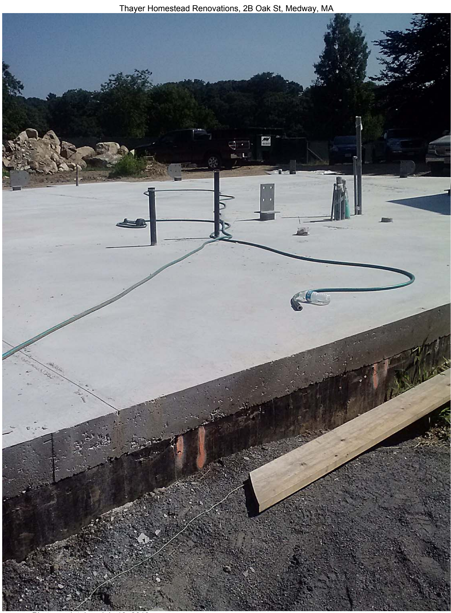
Photograph taken July 18, 2013