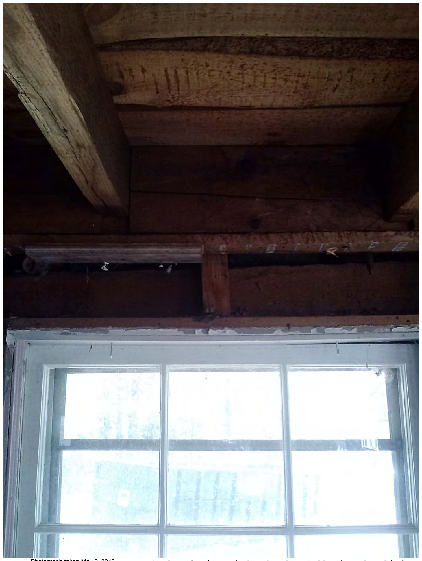
Photograph taken May 2, 2013 Typical existing window header following demolition