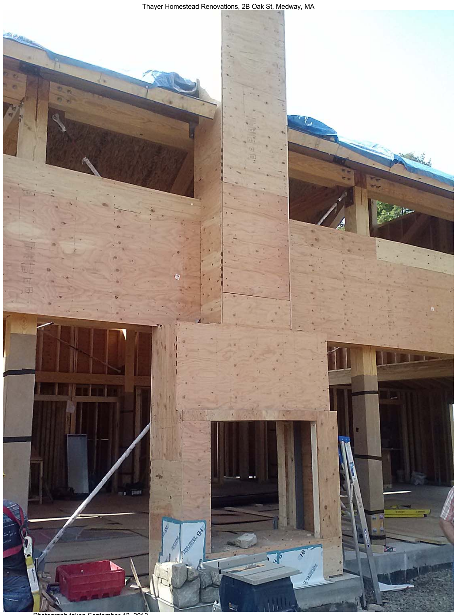
Photograph taken September 12, 2013