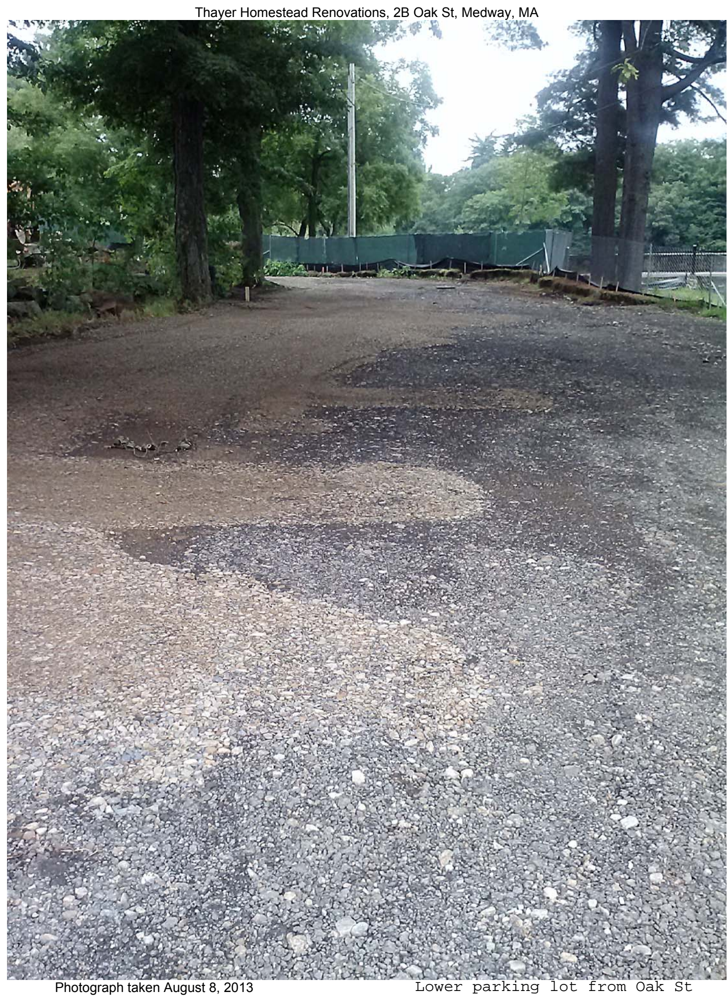
Lower parking lot from Oak St