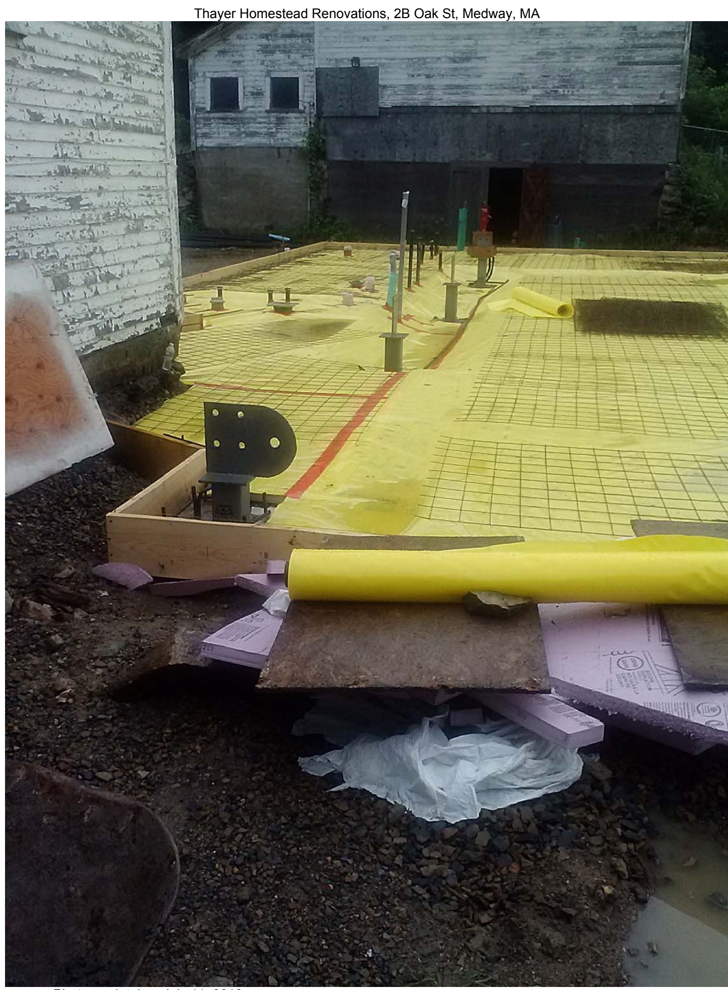
Photograph taken July 11, 2013