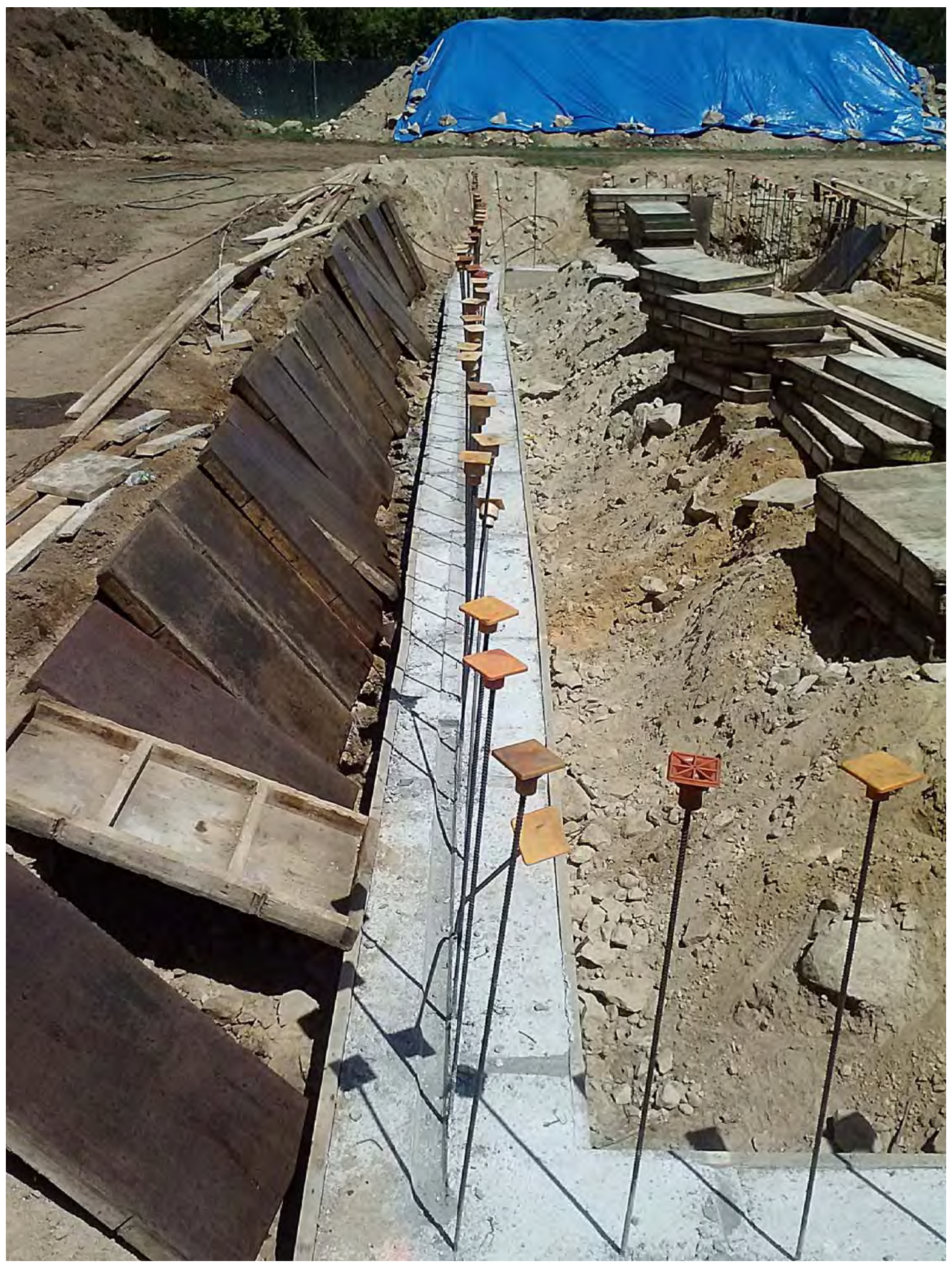
Photograph taken May 16, 2013