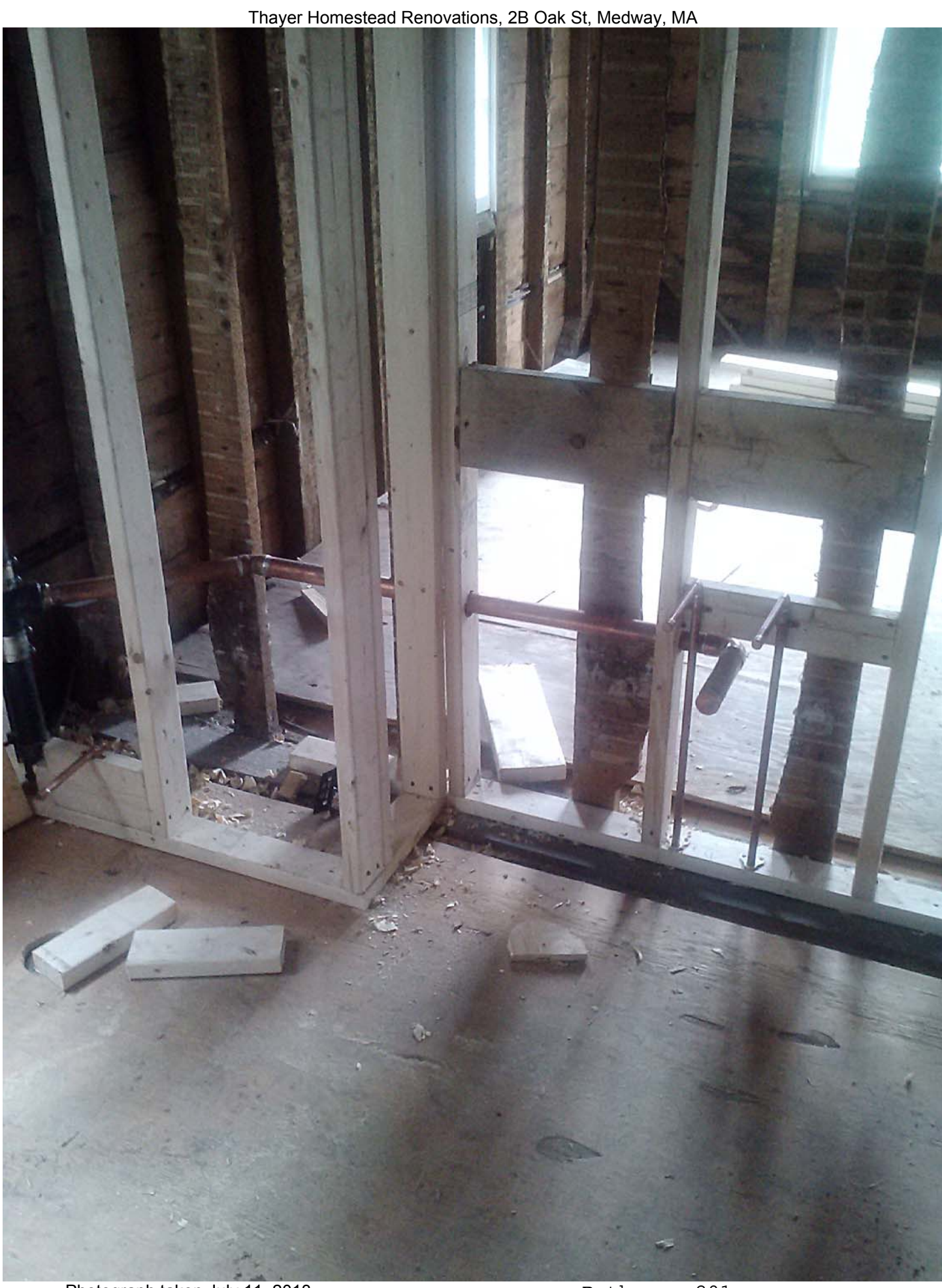
Photograph taken July 11, 2013