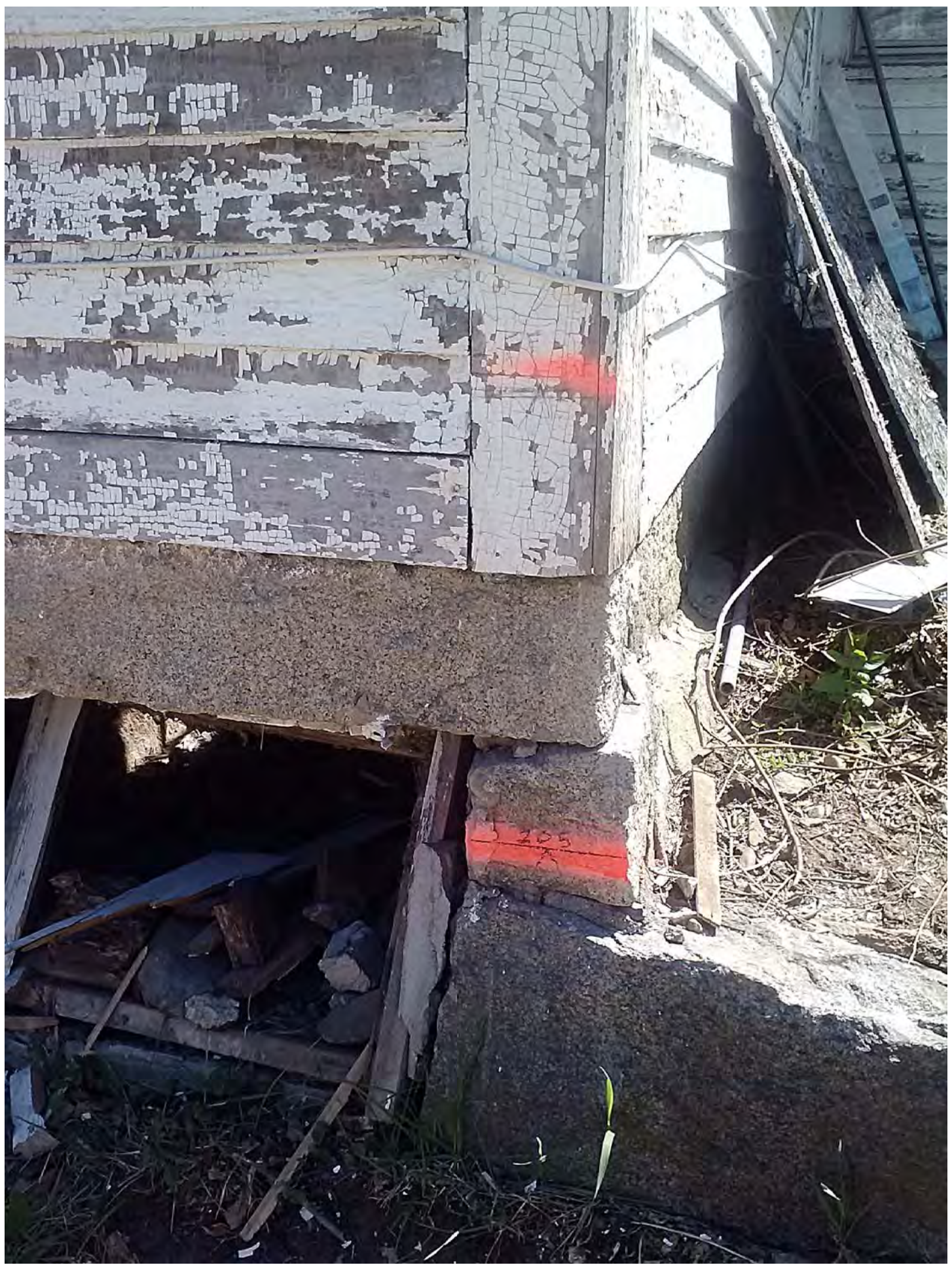
Photograph taken May 2, 2013 Finish floor elevation marked on existing foundation