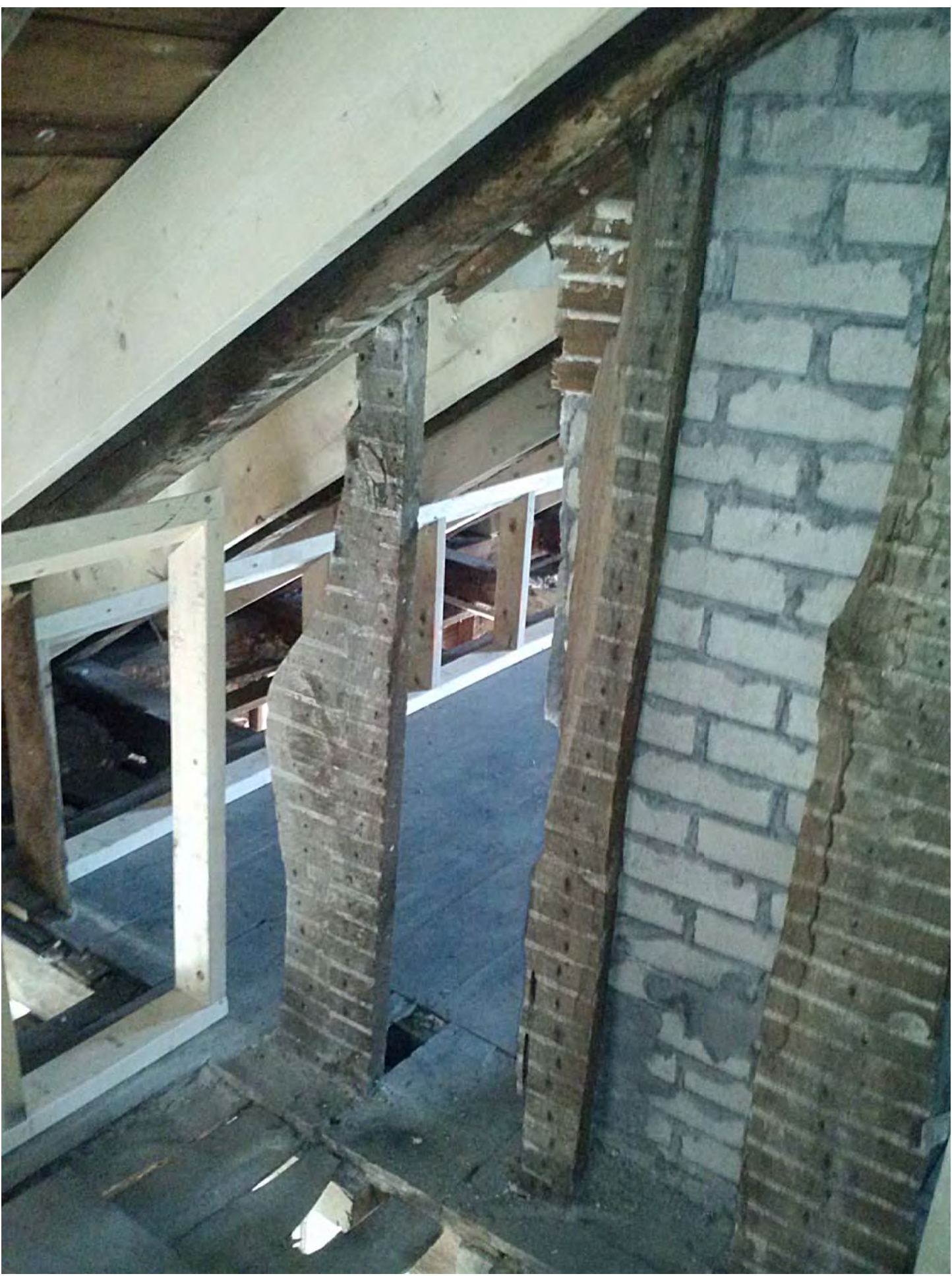
Photograph taken May 16, 2013