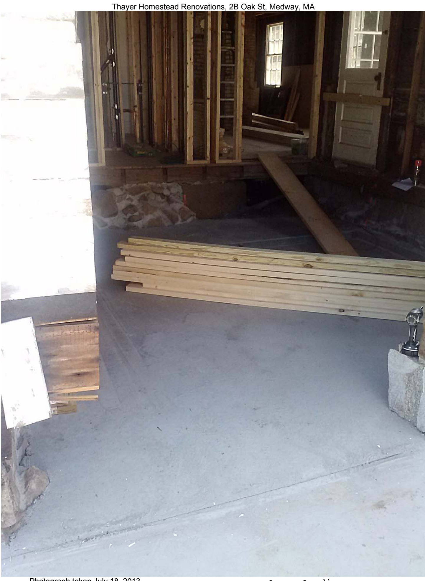
Photograph taken July 18, 2013