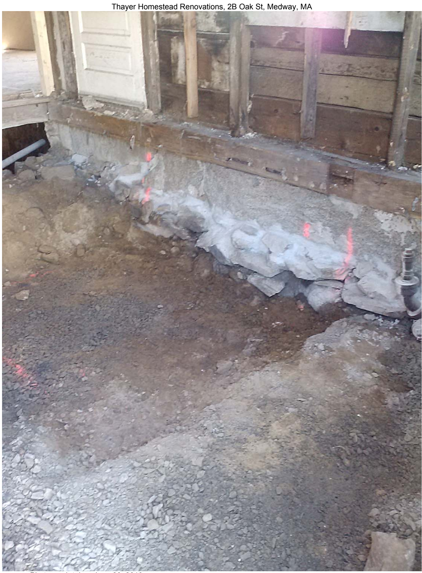
Photograph taken June 20, 2013