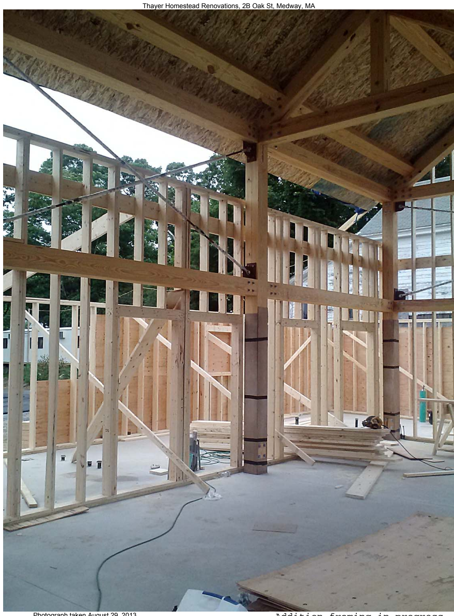
Addition framing in progress