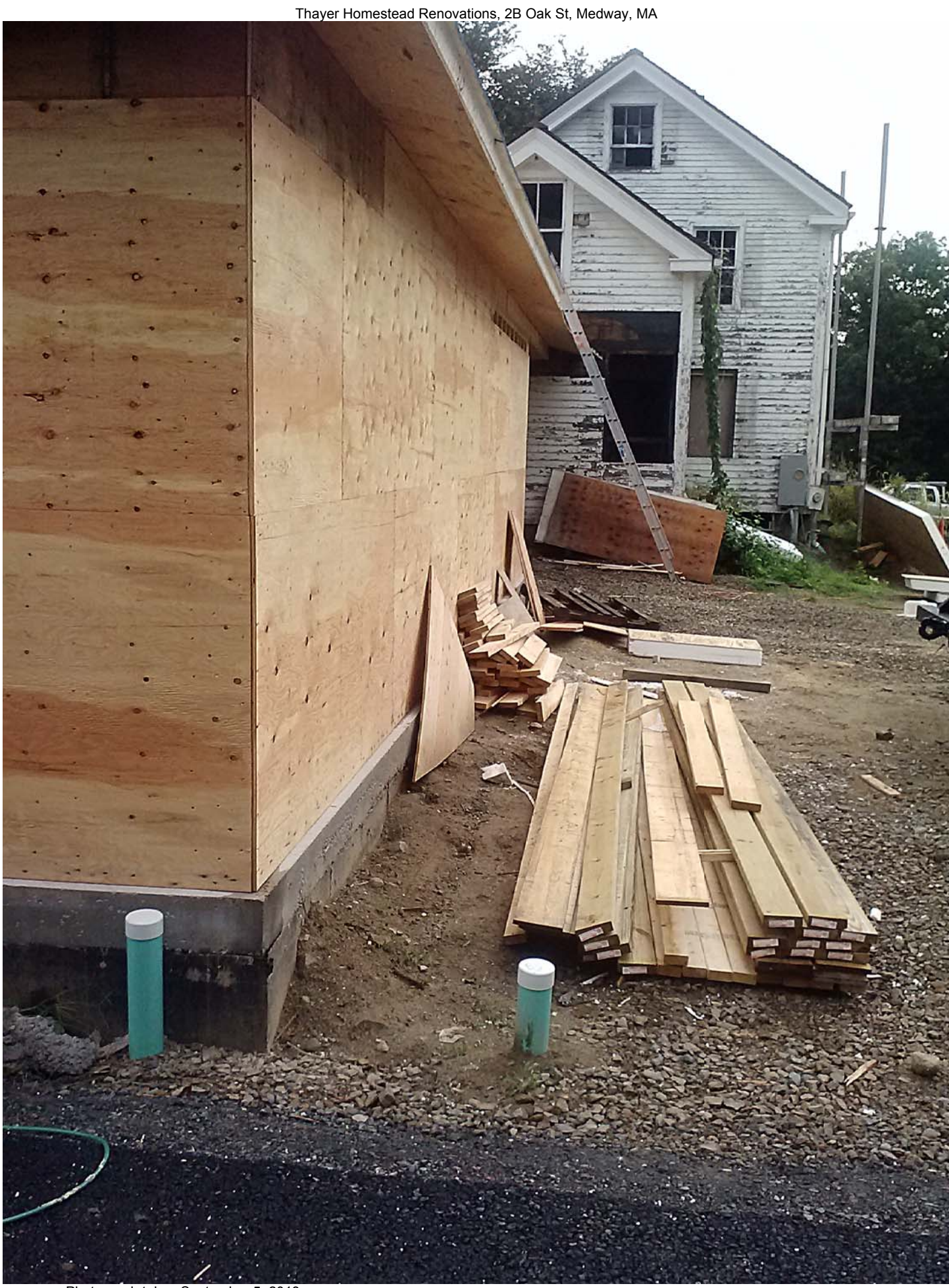
Photograph taken September 5, 2013