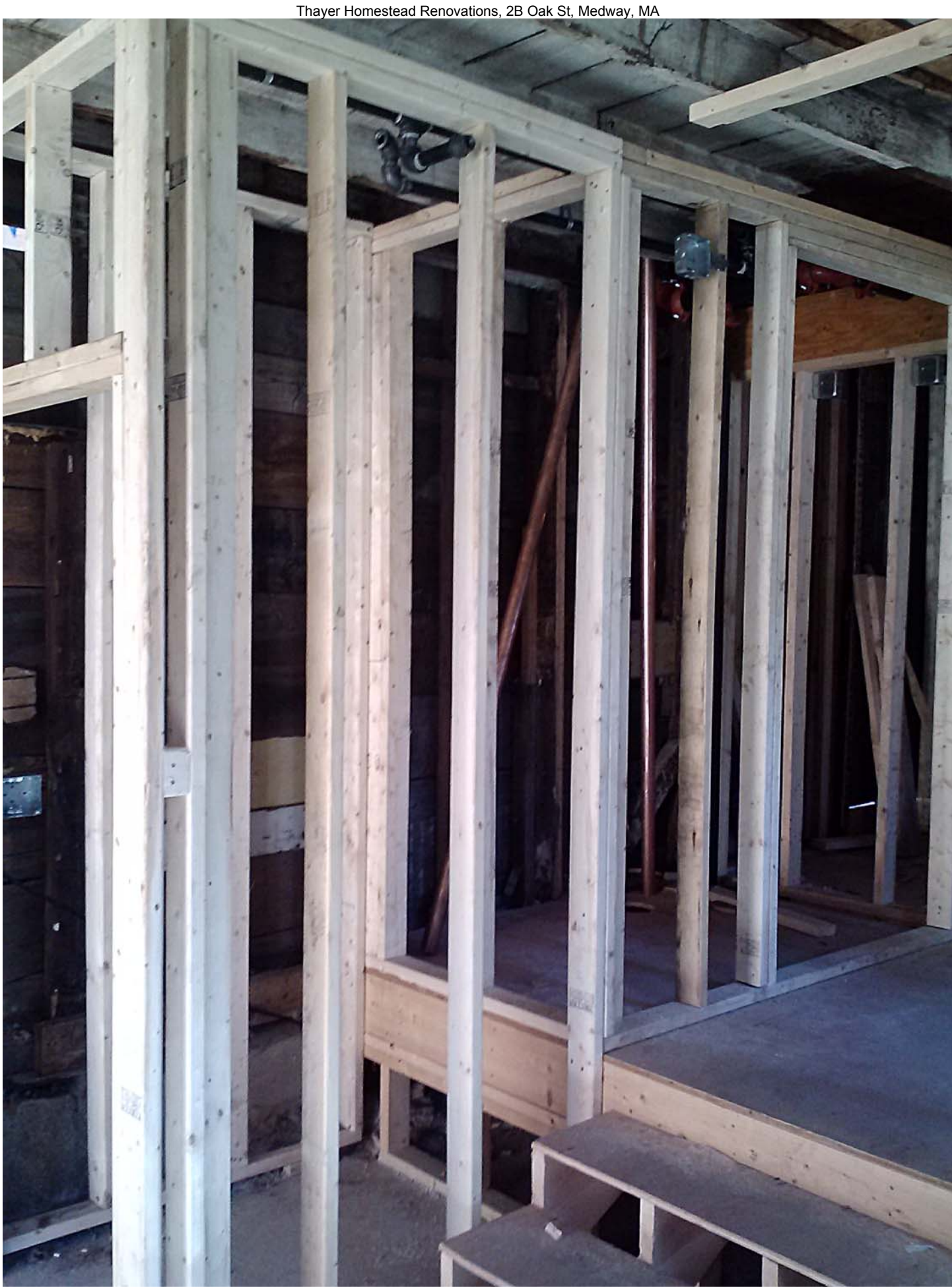
Photograph taken September 19, 2013