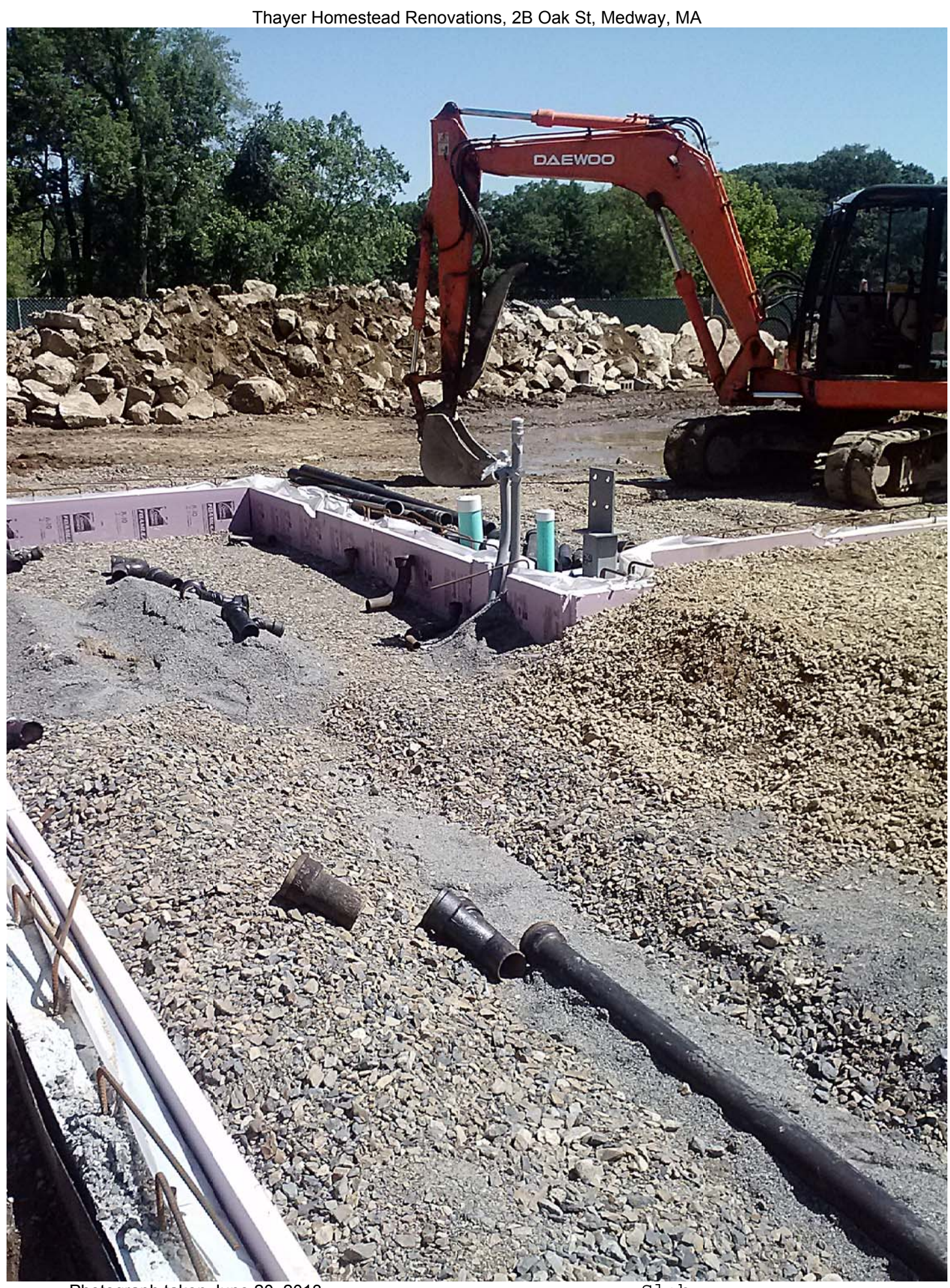
Photograph taken June 20, 2013