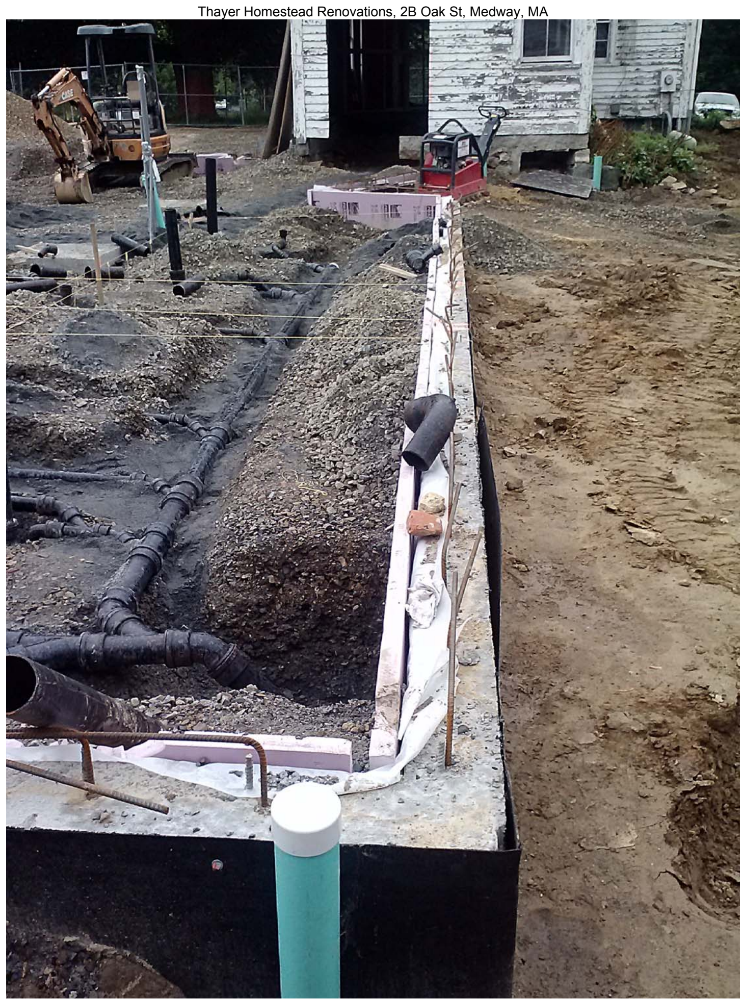
Photograph taken June 13, 2013