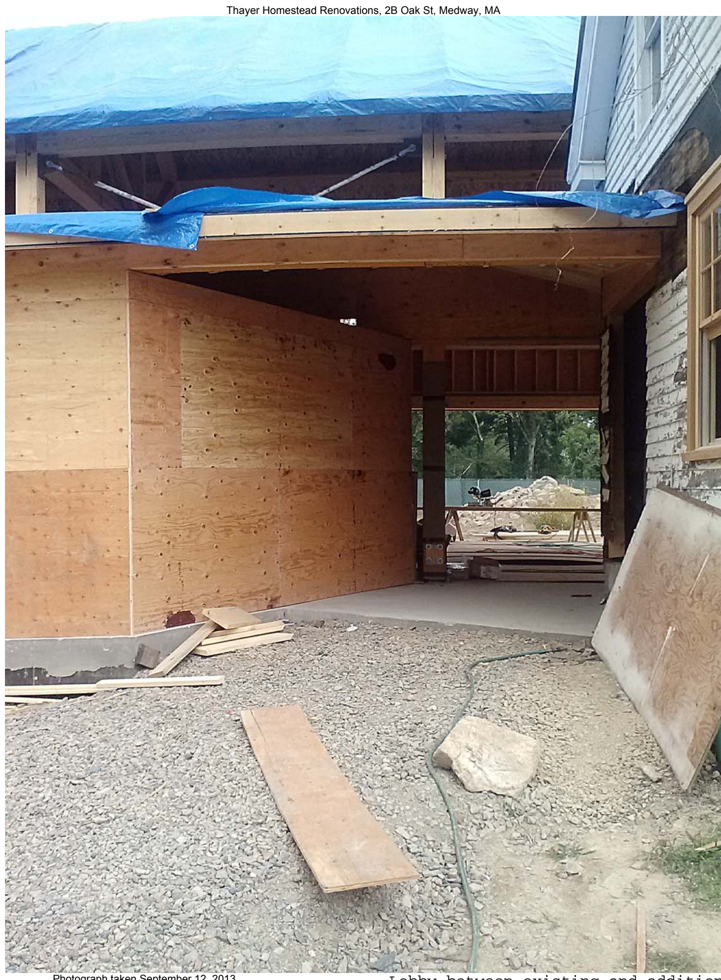
Photograph taken September 12, 2013