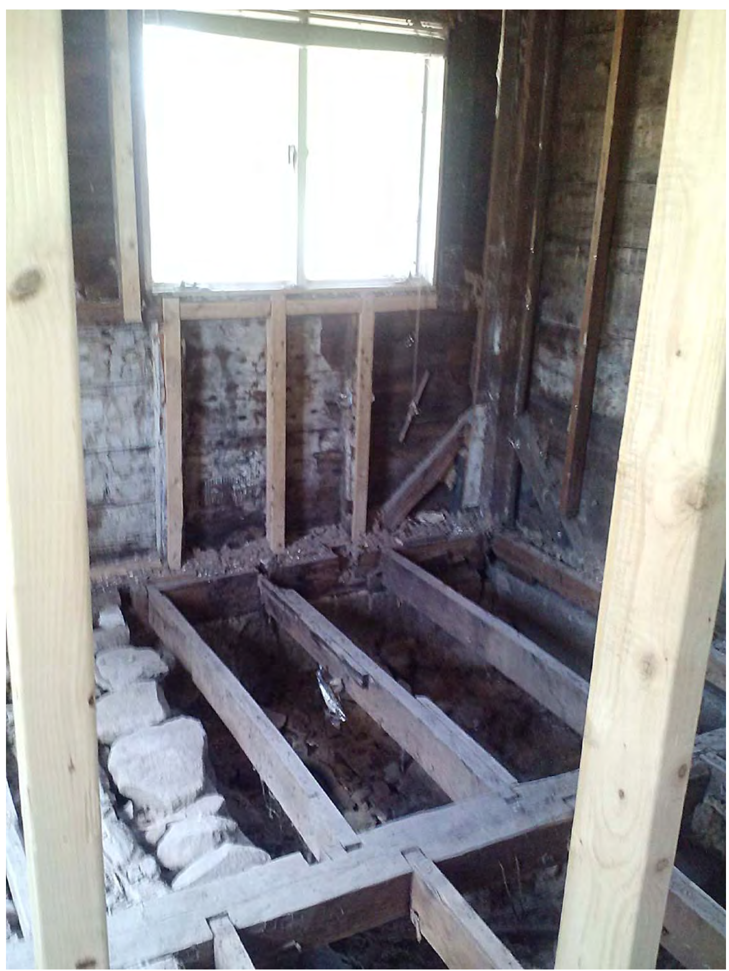
Photograph taken May 16, 2013