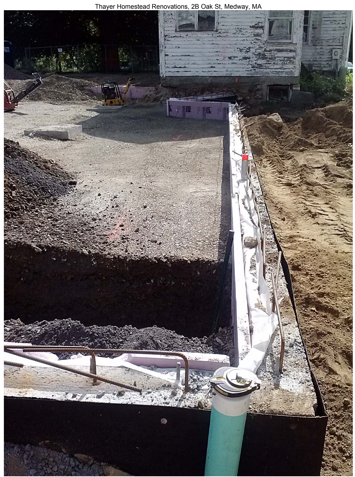
Photograph taken June 6, 2013