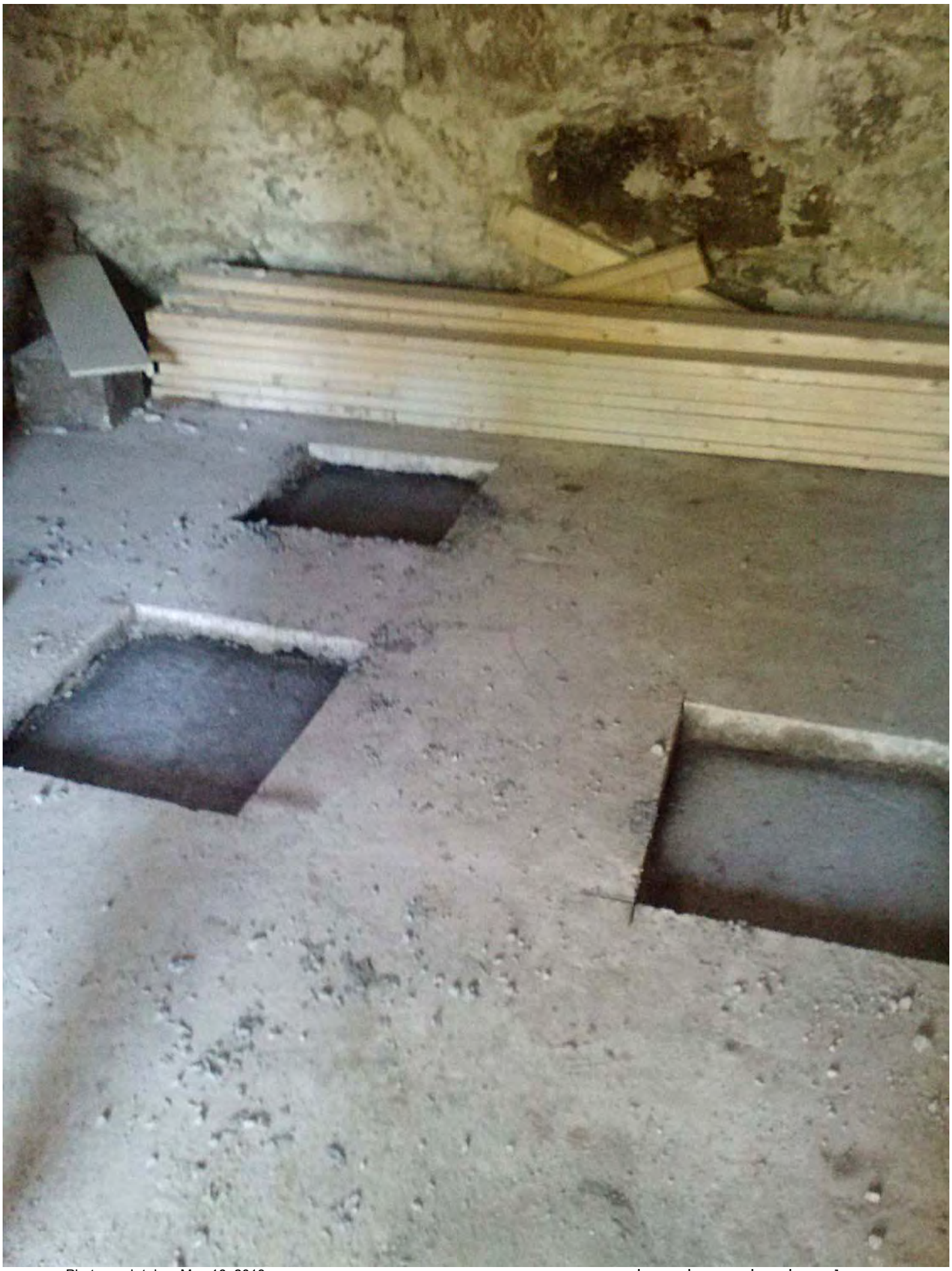
Photograph taken May 16, 2013