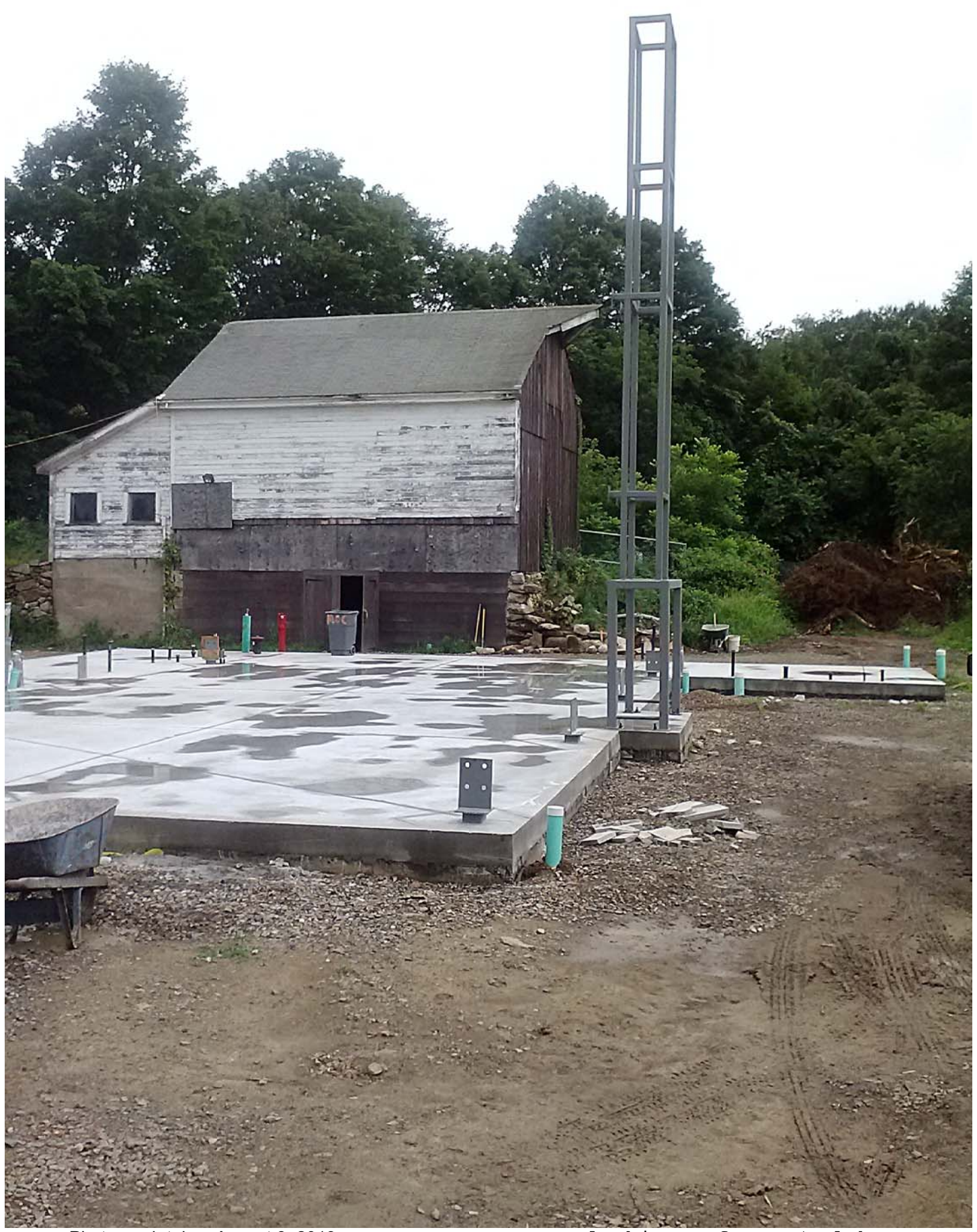
Photograph taken August 8, 2013