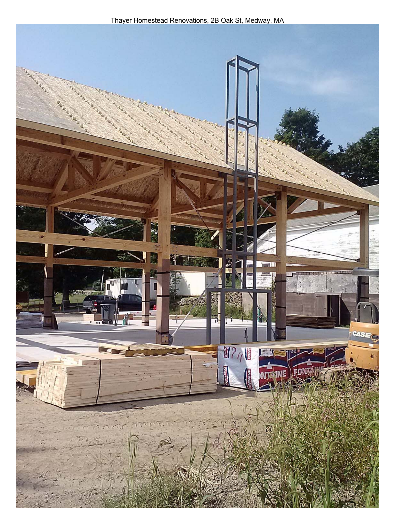
Photograph taken August 22, 2013