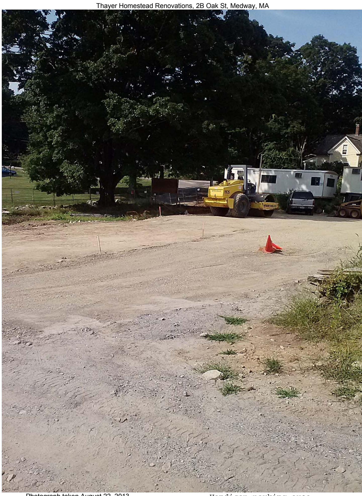
Photograph taken August 22, 2013