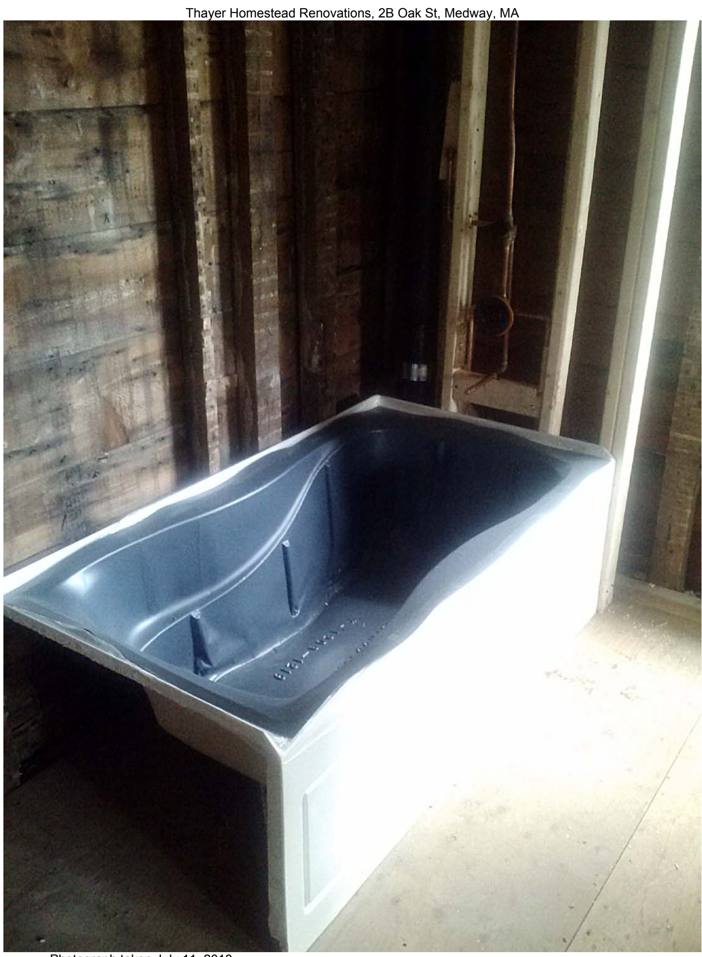
Photograph taken July 11, 2013