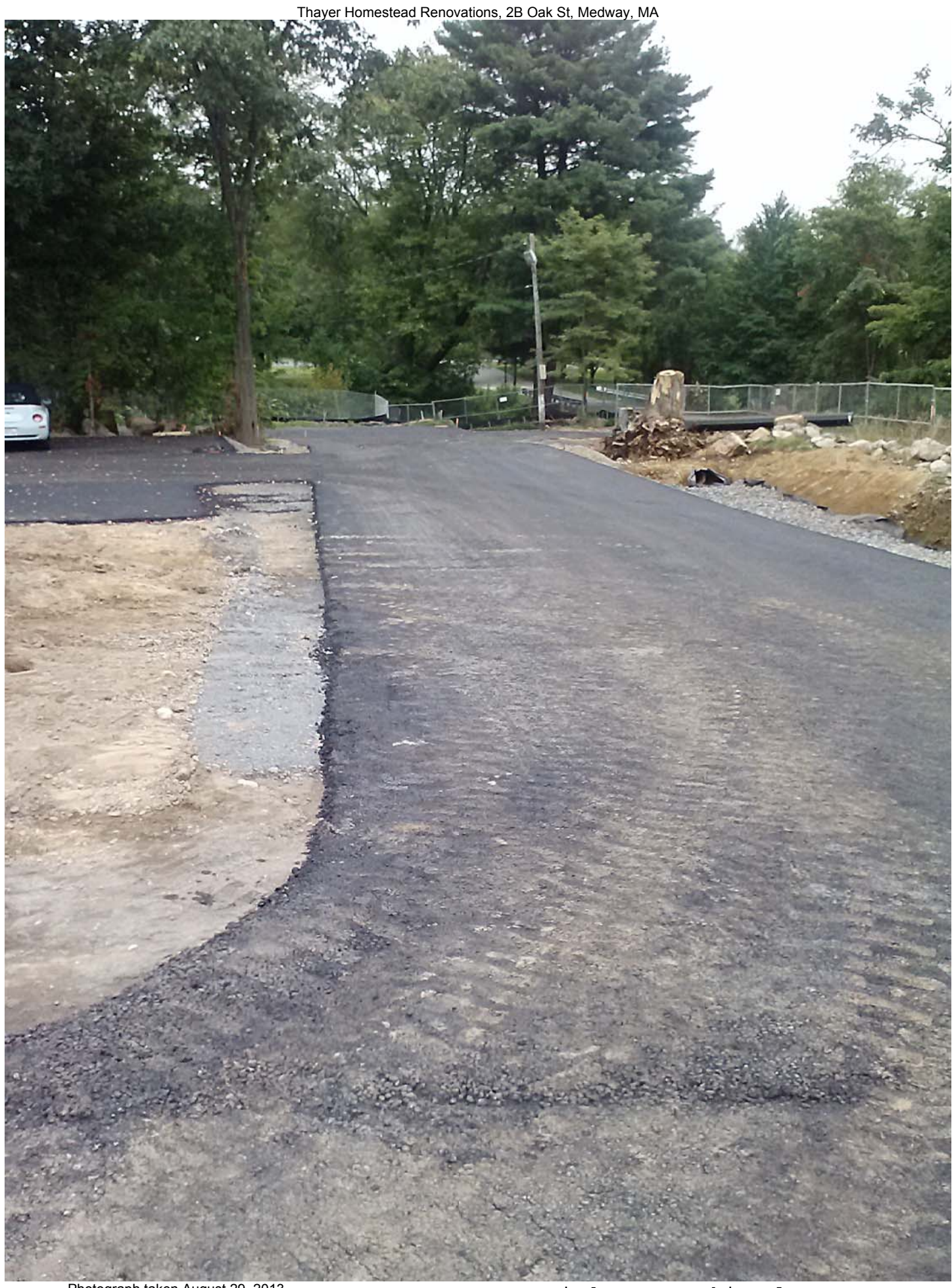
Binder at parking lot