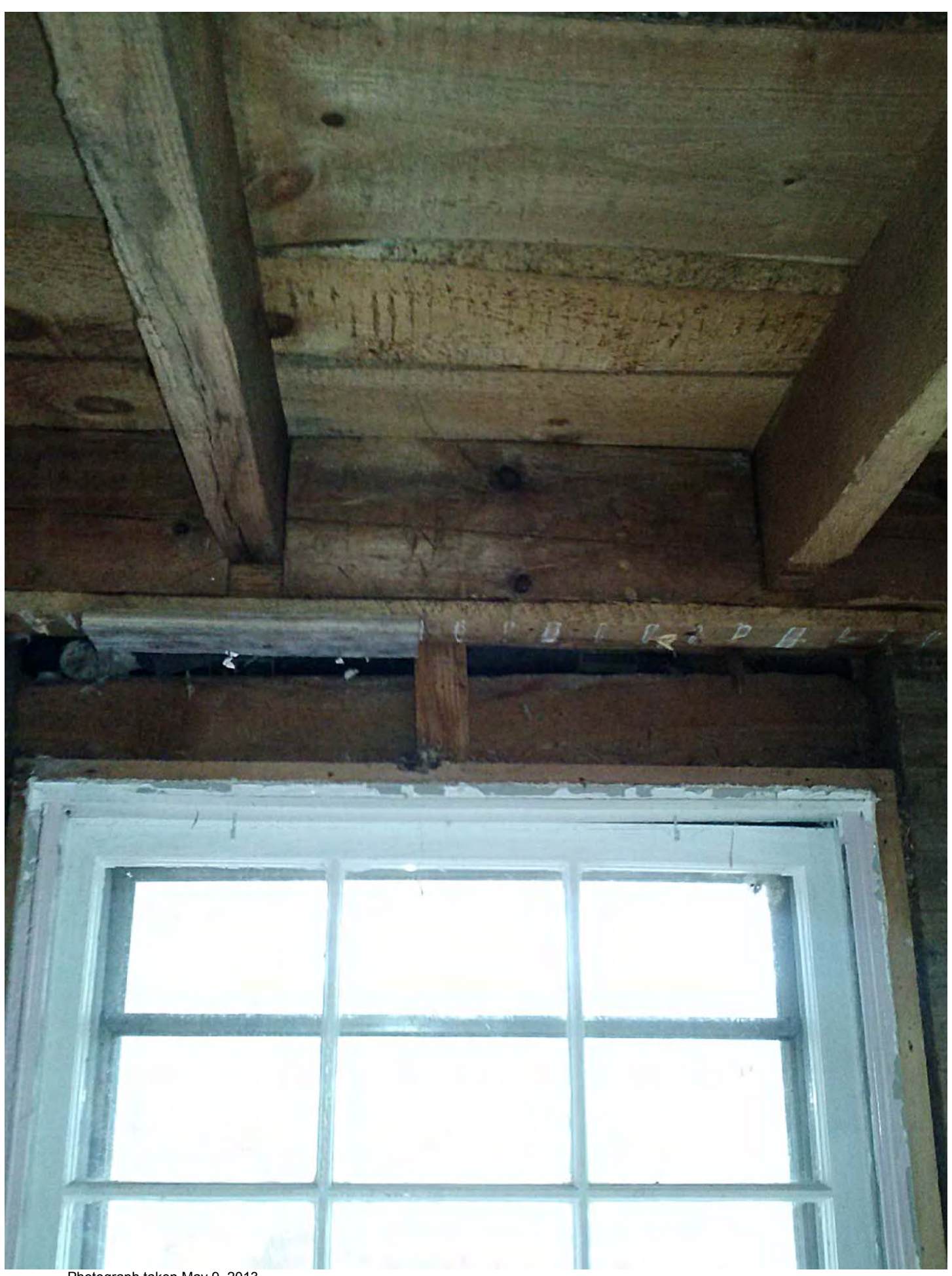
Photograph taken May 9, 2013