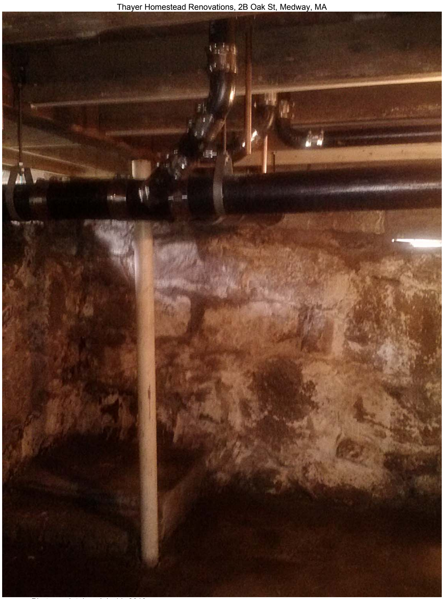
Photograph taken July 11, 2013