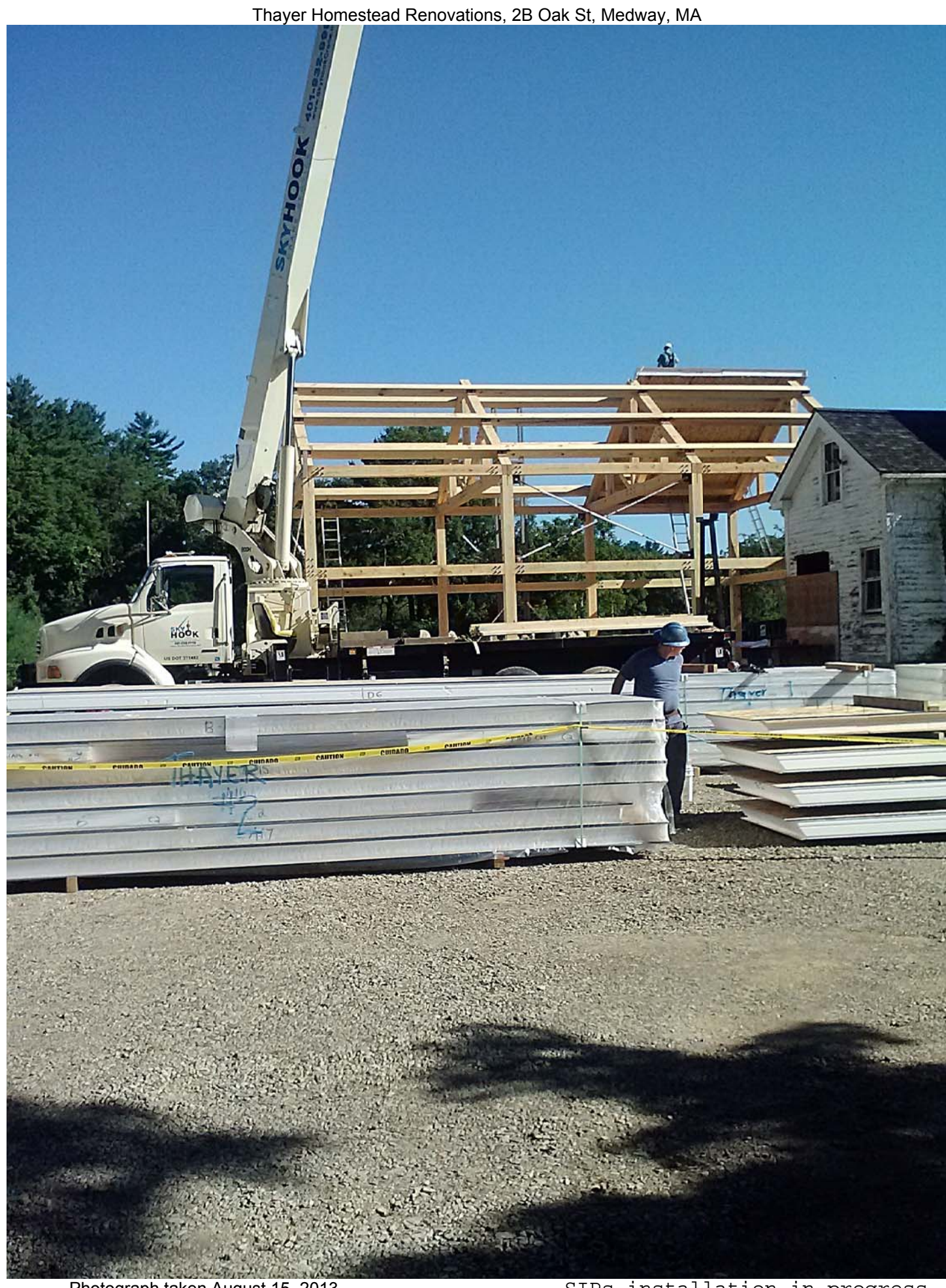
Photograph taken August 15, 2013