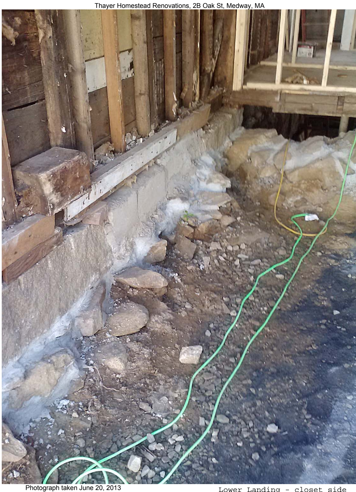
Lower Landing - closet side