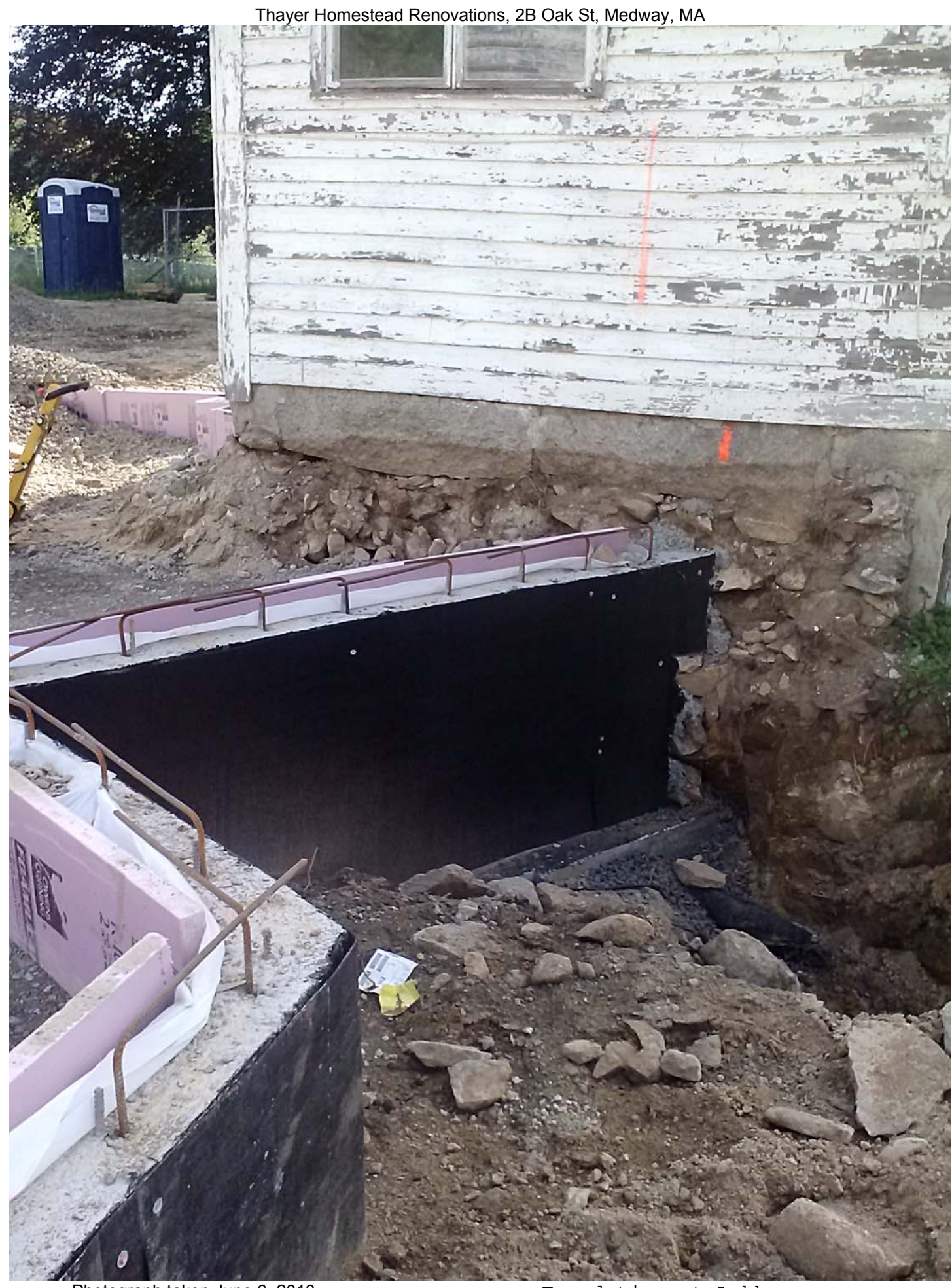
Photograph taken June 6, 2013