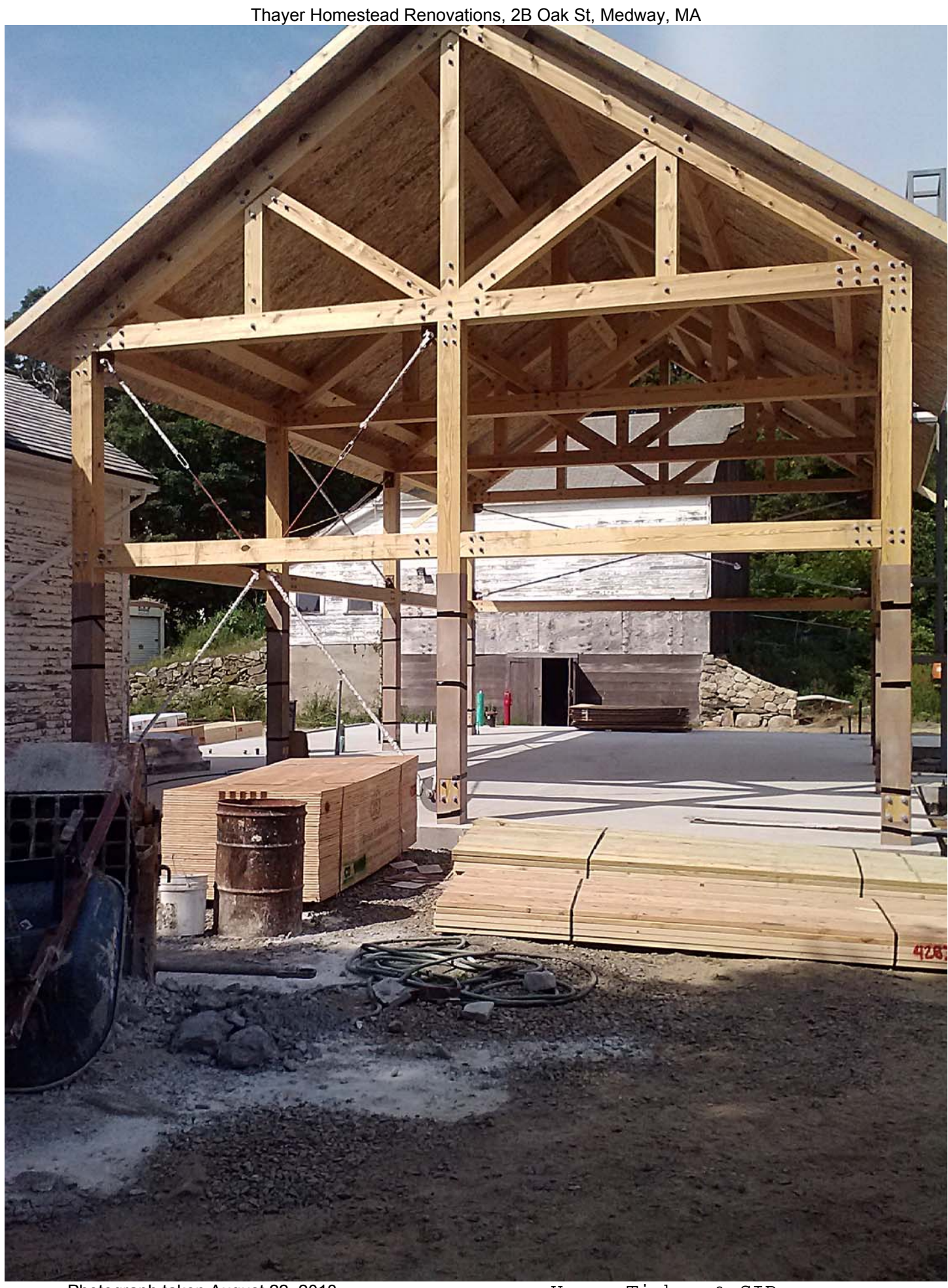
Photograph taken August 22, 2013