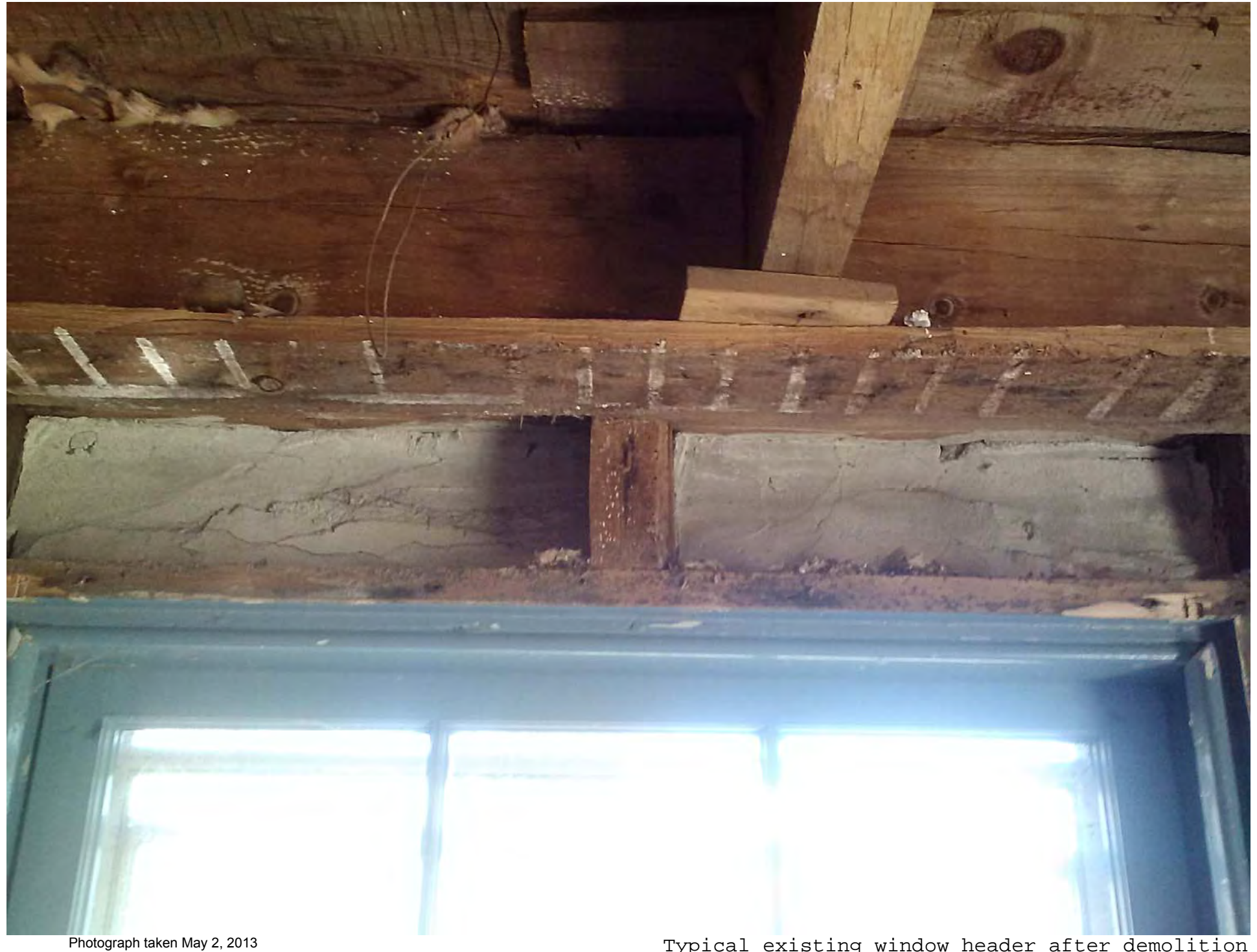
Typical existing window header after demolition