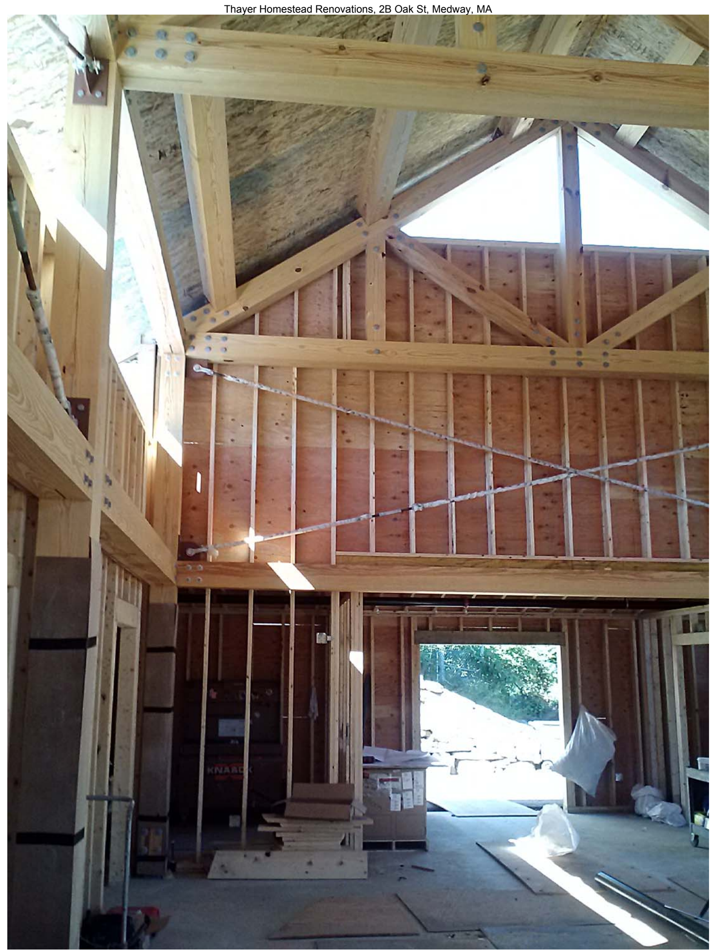
Photograph taken September 19, 2013