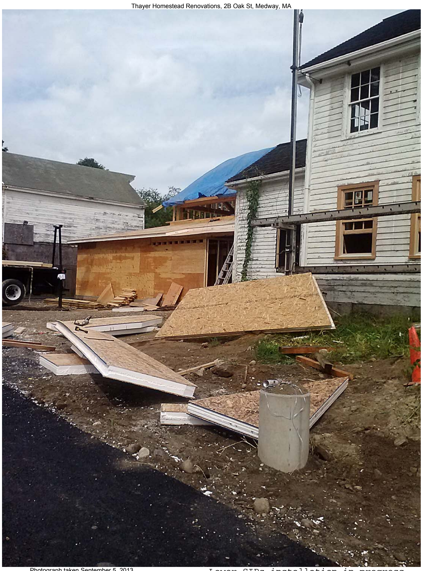
Photograph taken September 5, 2013