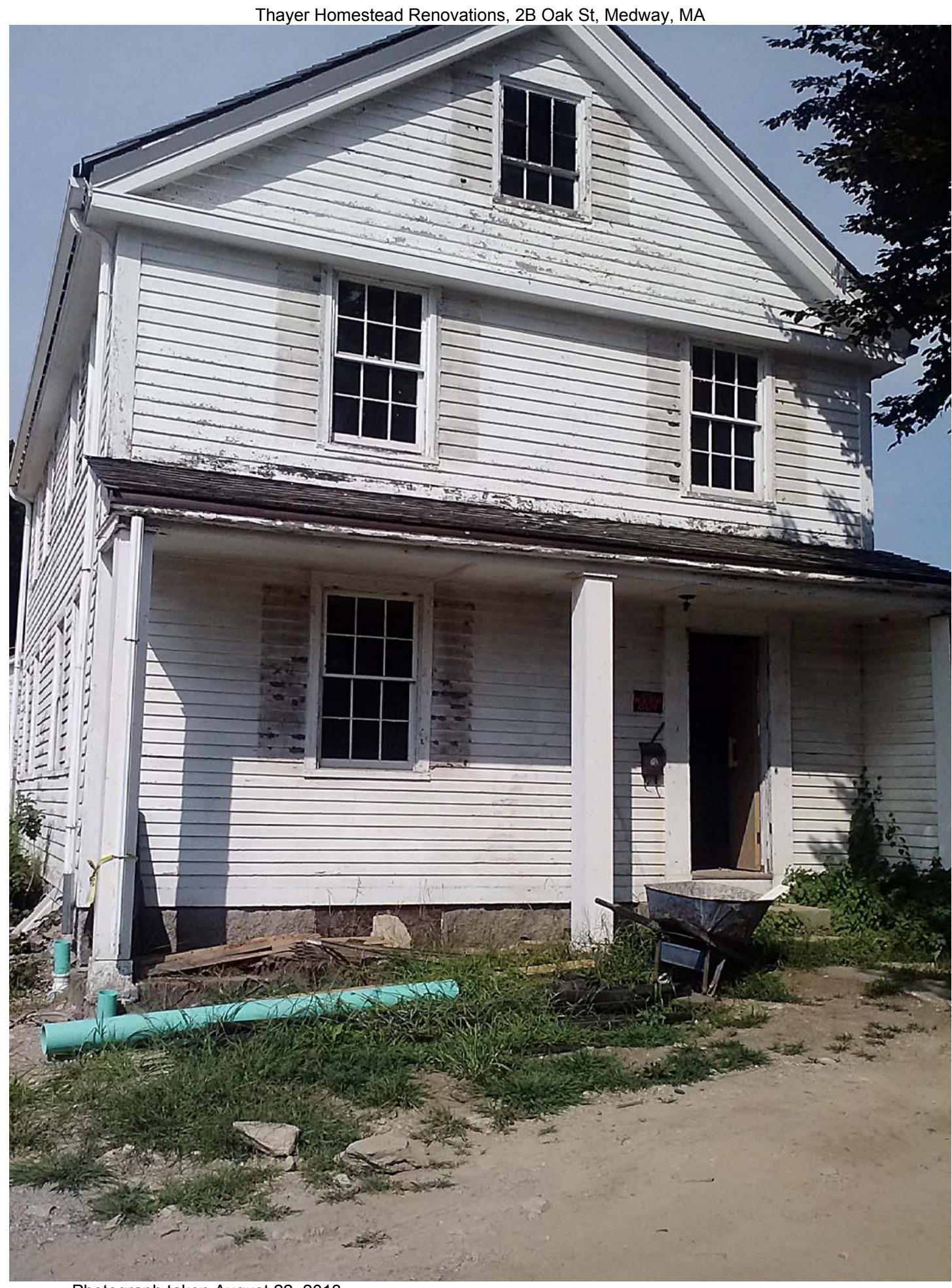
Photograph taken August 22, 2013