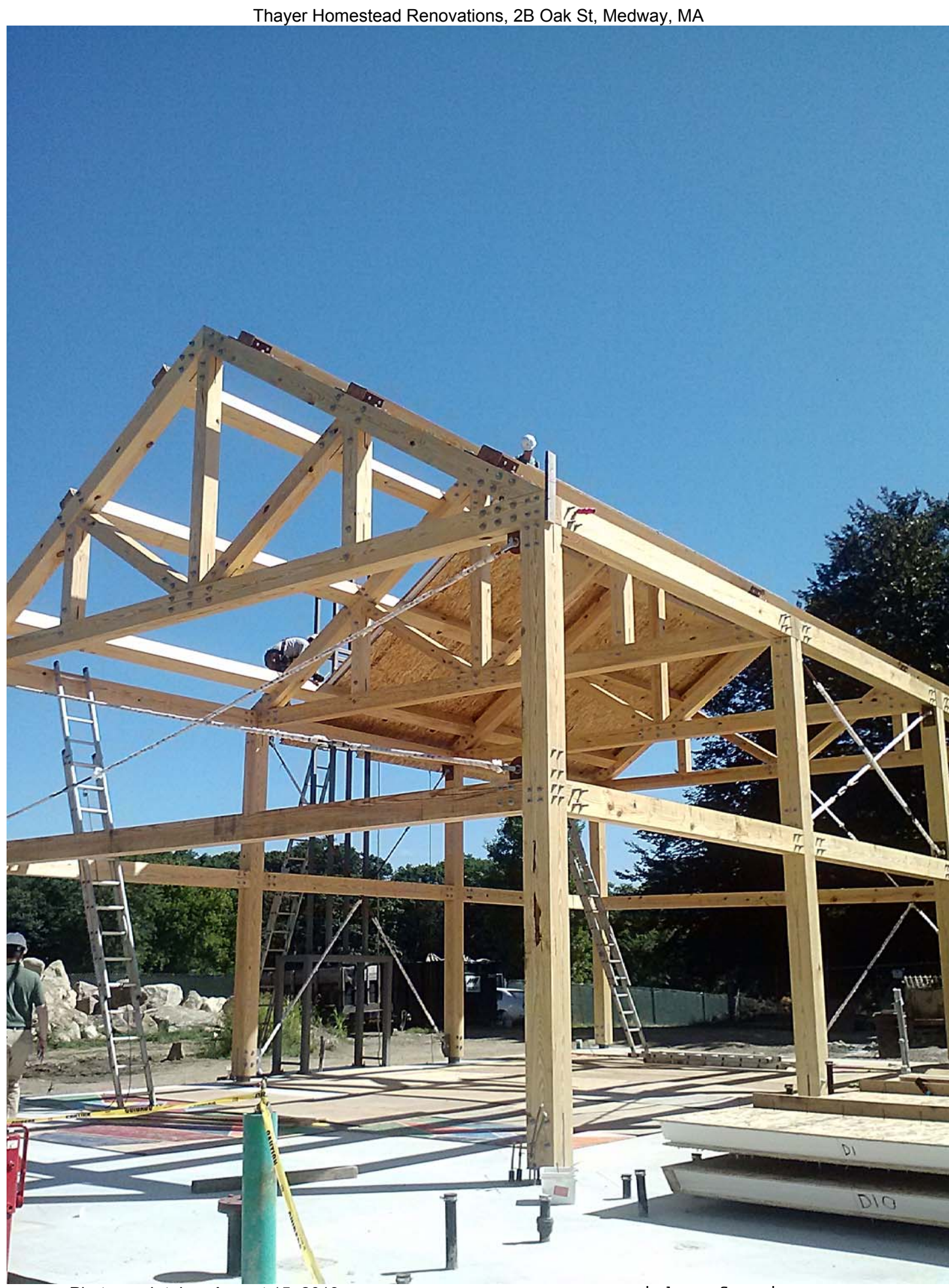
Photograph taken August 15, 2013