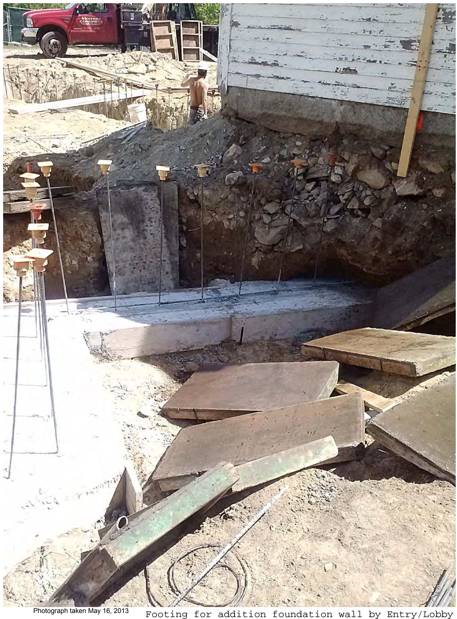
Footing for addition foundation wall by Entry/Lobby