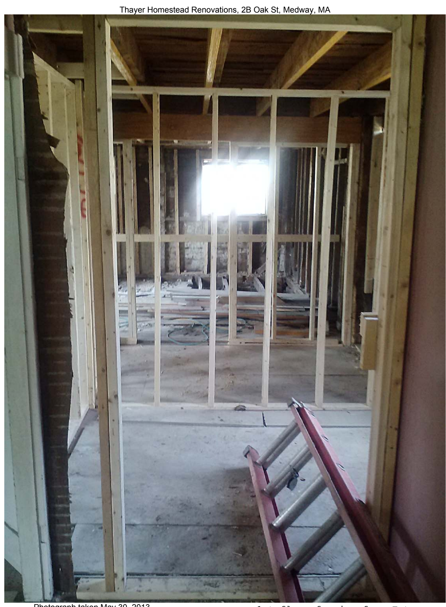
Photograph taken May 30, 2013