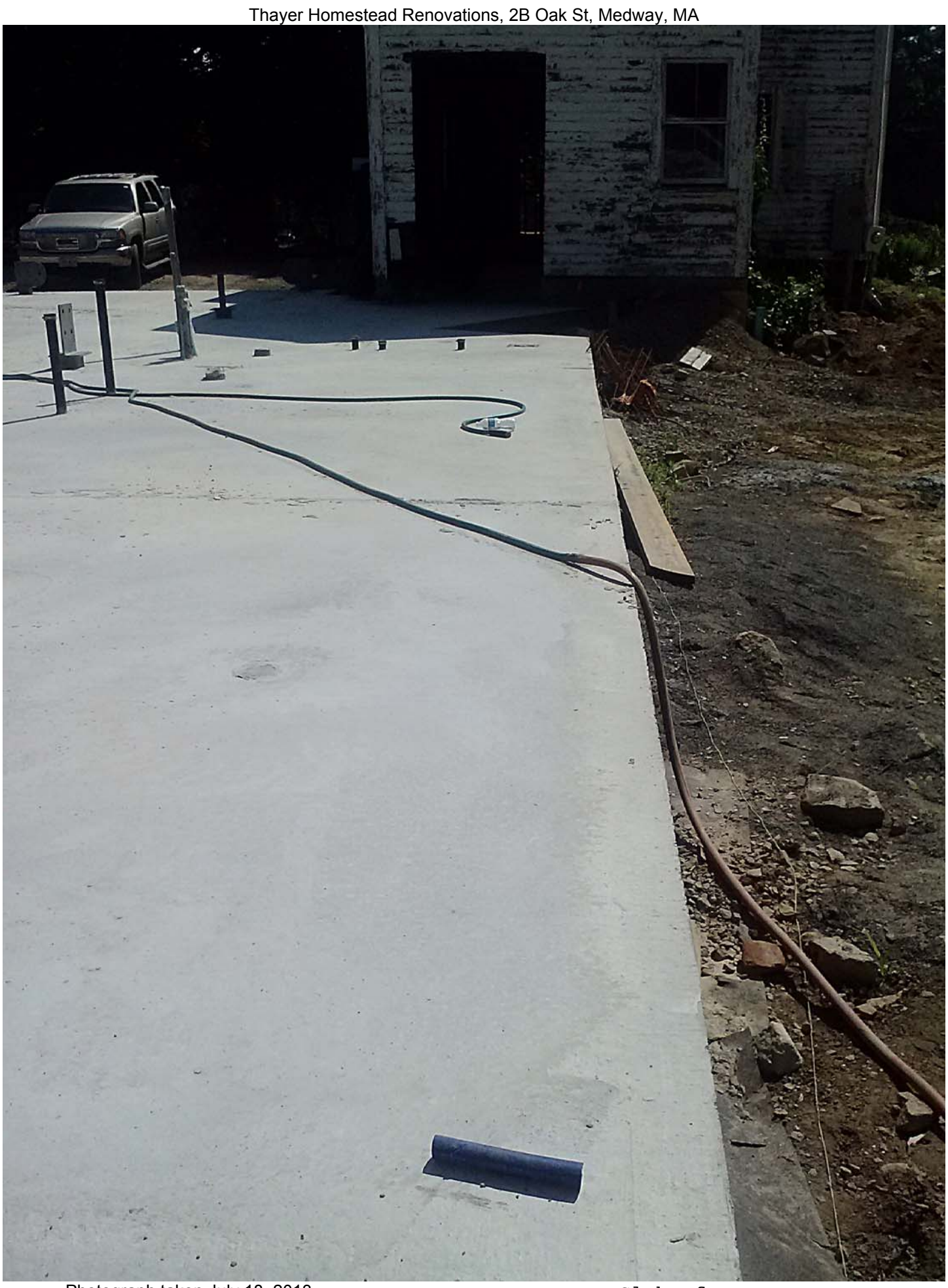
Photograph taken July 18, 2013