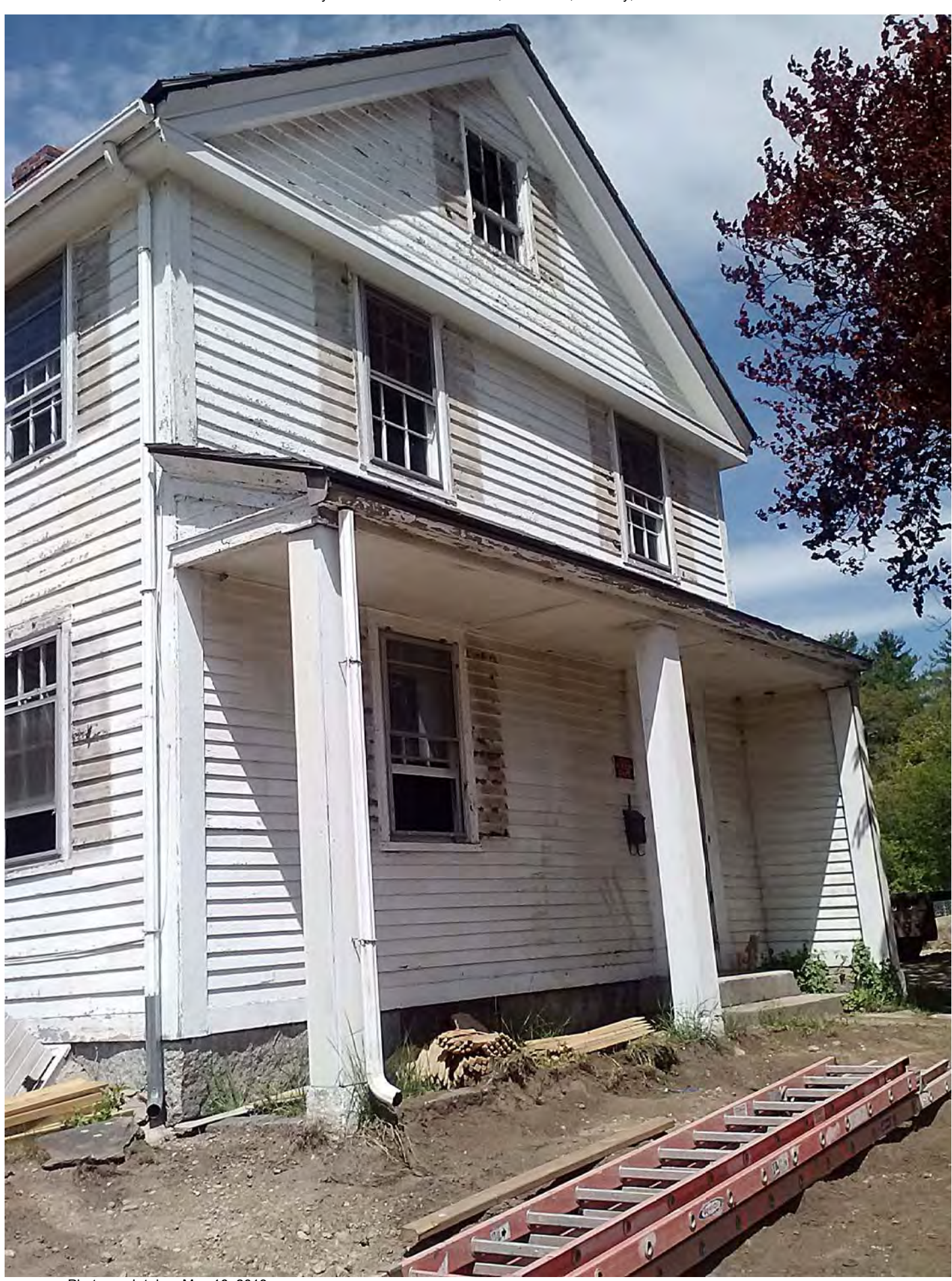
Photograph taken May 16, 2013