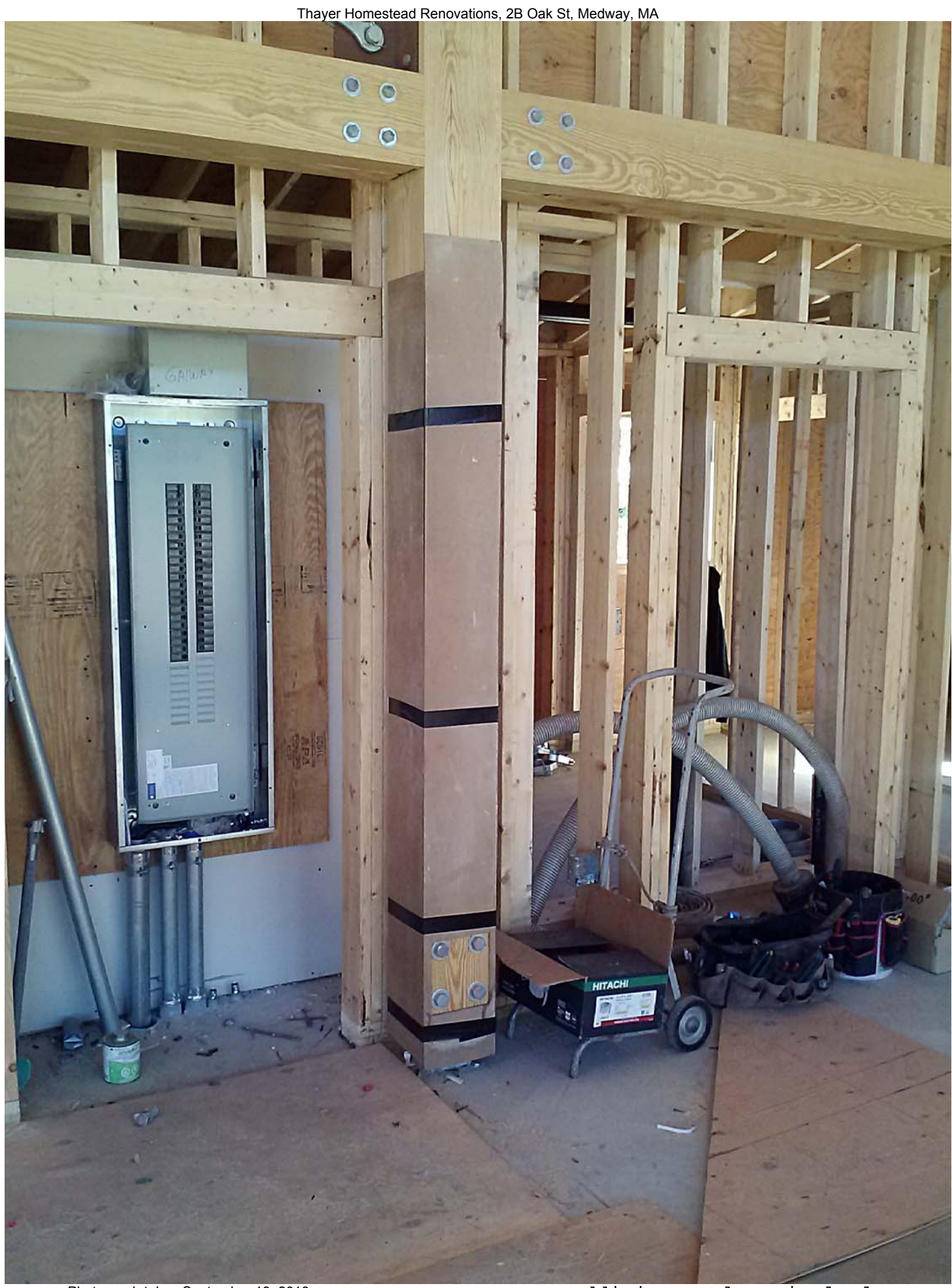
Photograph taken September 19, 2013