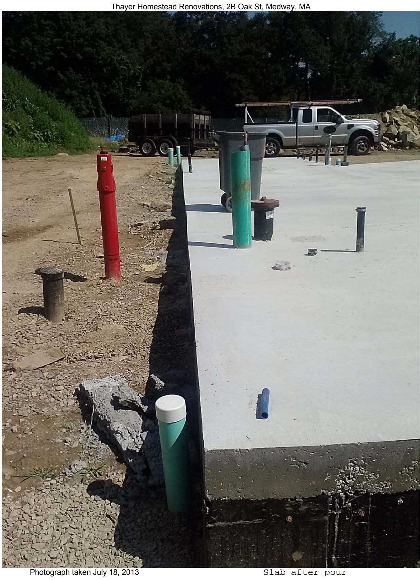
Slab after pour