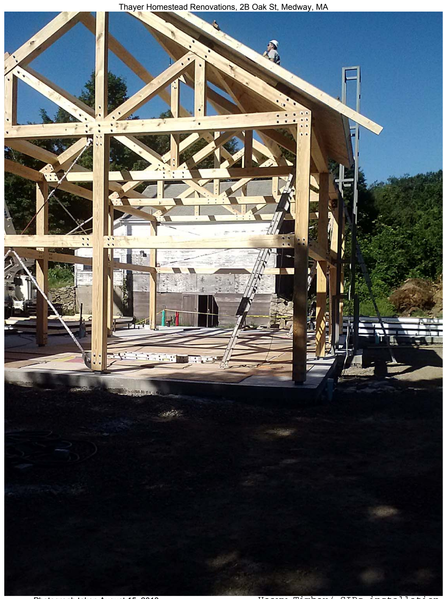
Photograph taken August 15, 2013