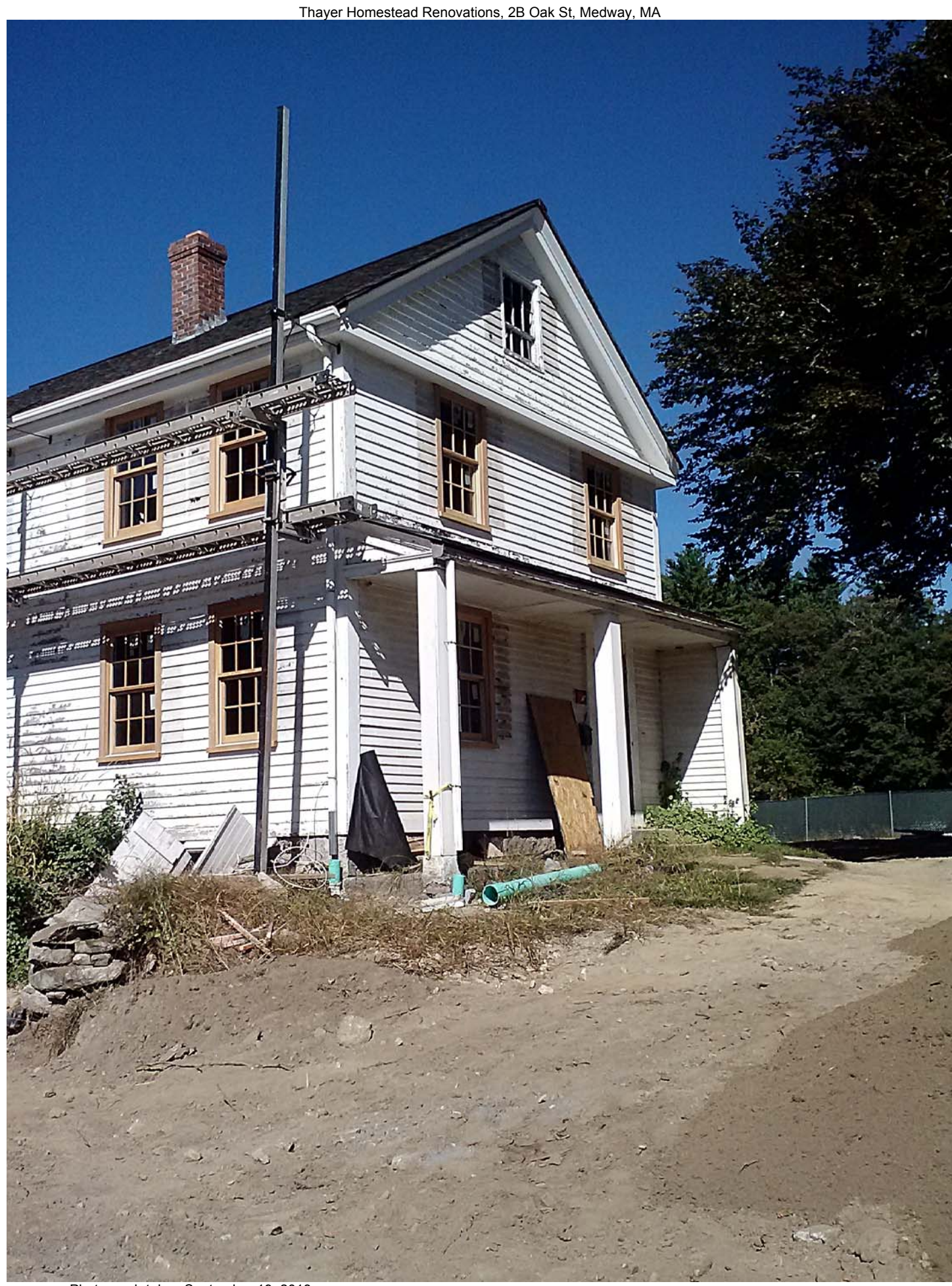
Photograph taken September 19, 2013