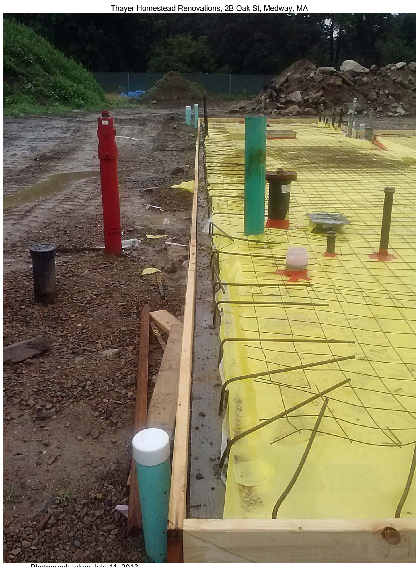
Photograph taken July 11, 2013