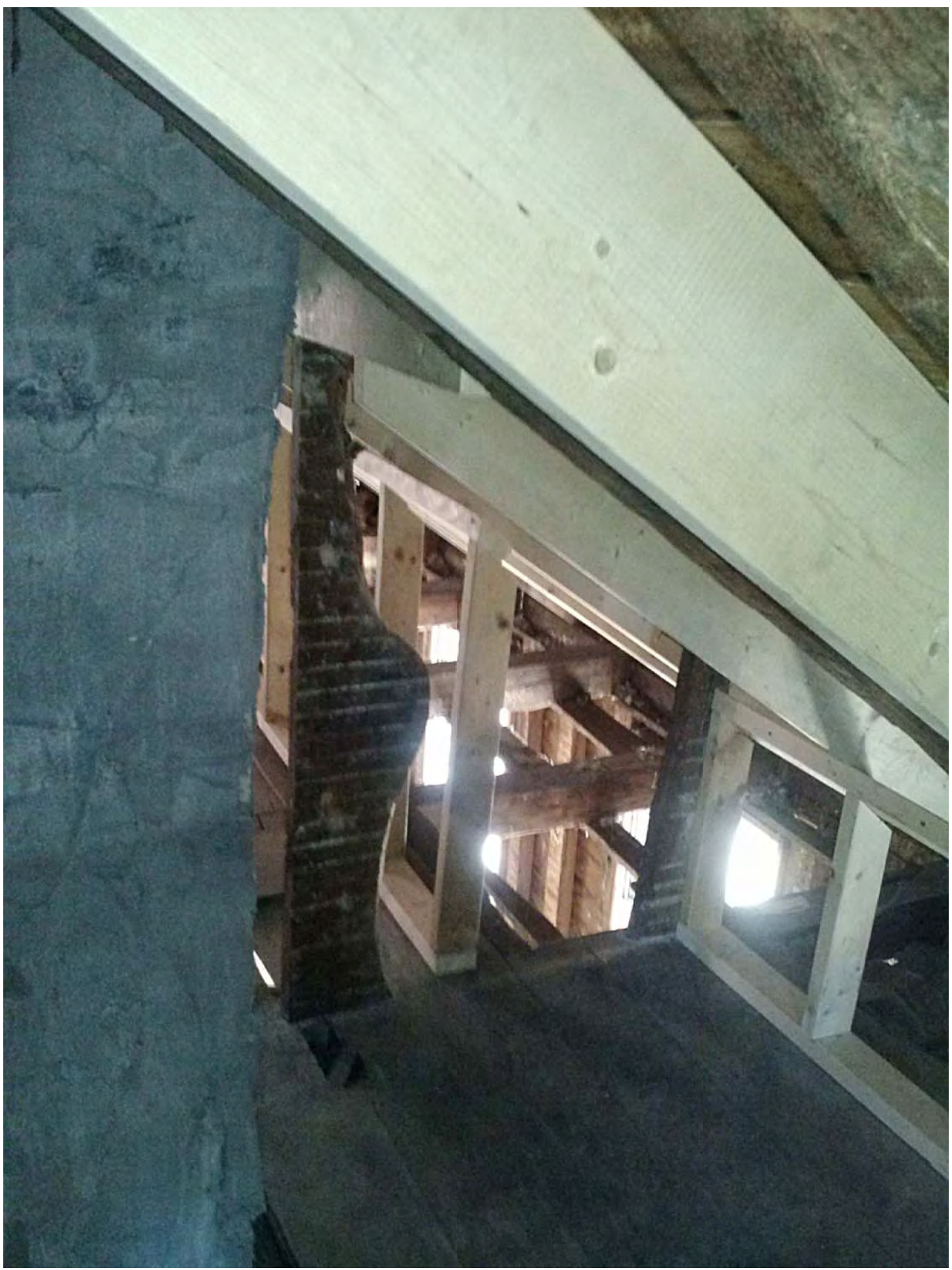
Photograph taken May 16, 2013