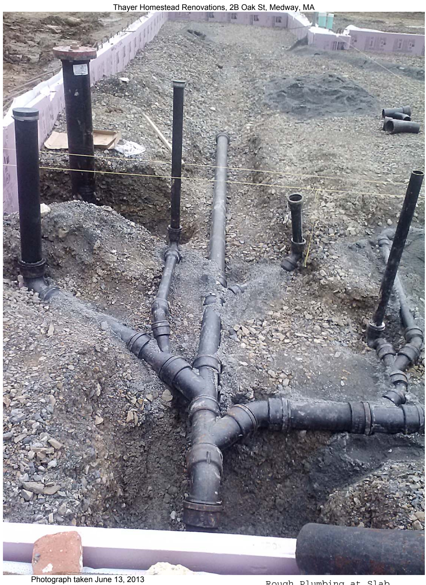
Rough Plumbing at Slab