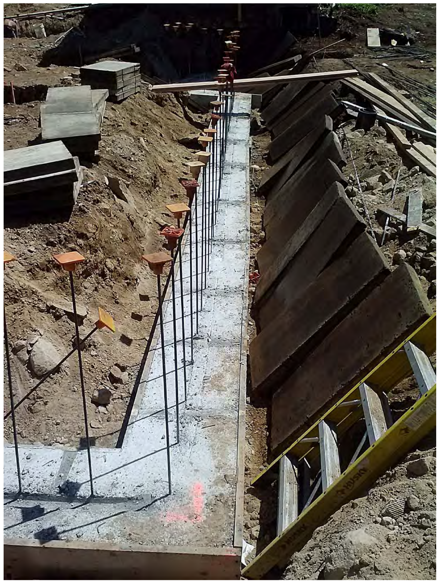
Photograph taken May 16, 2013