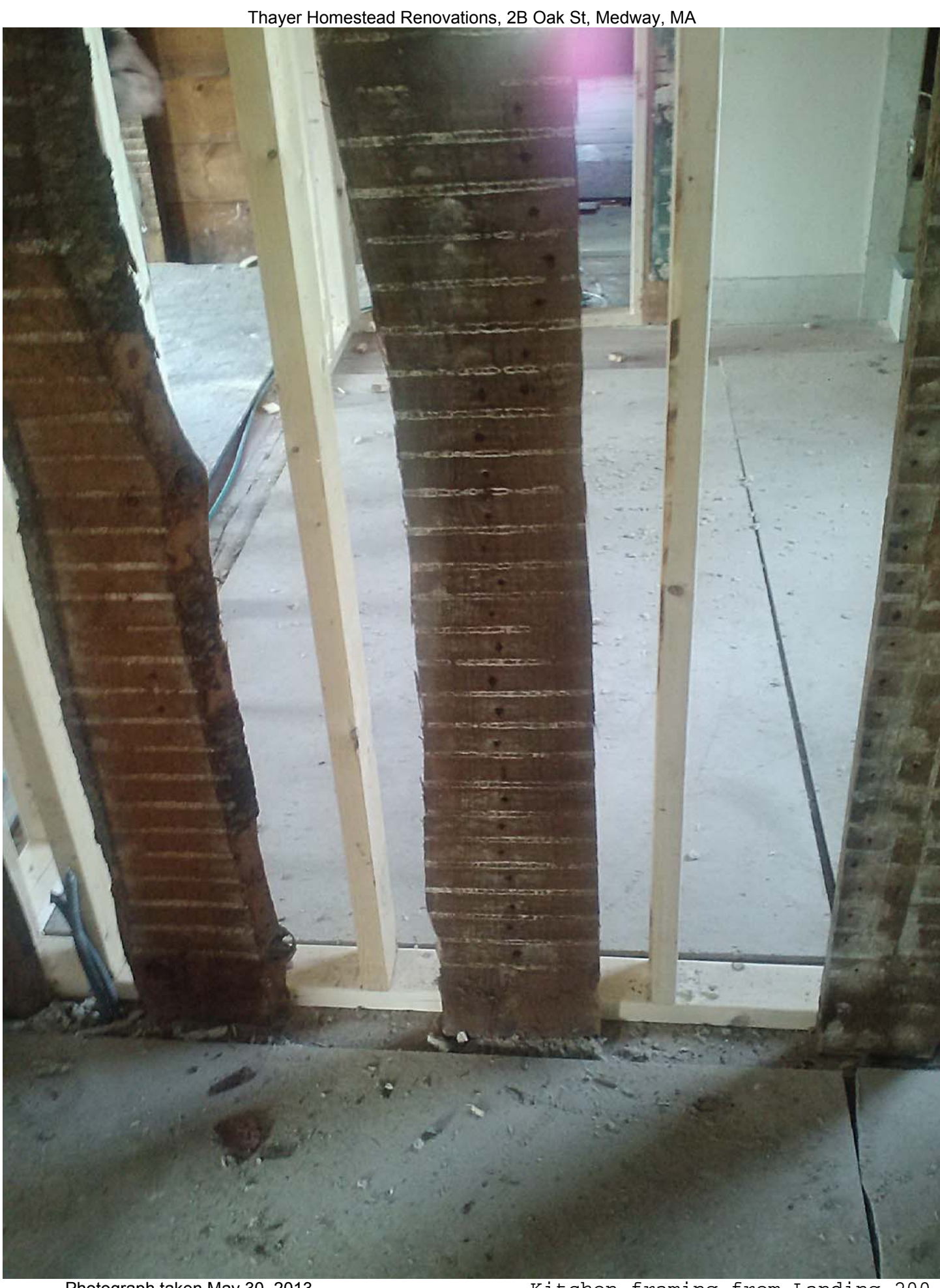
Photograph taken May 30, 2013