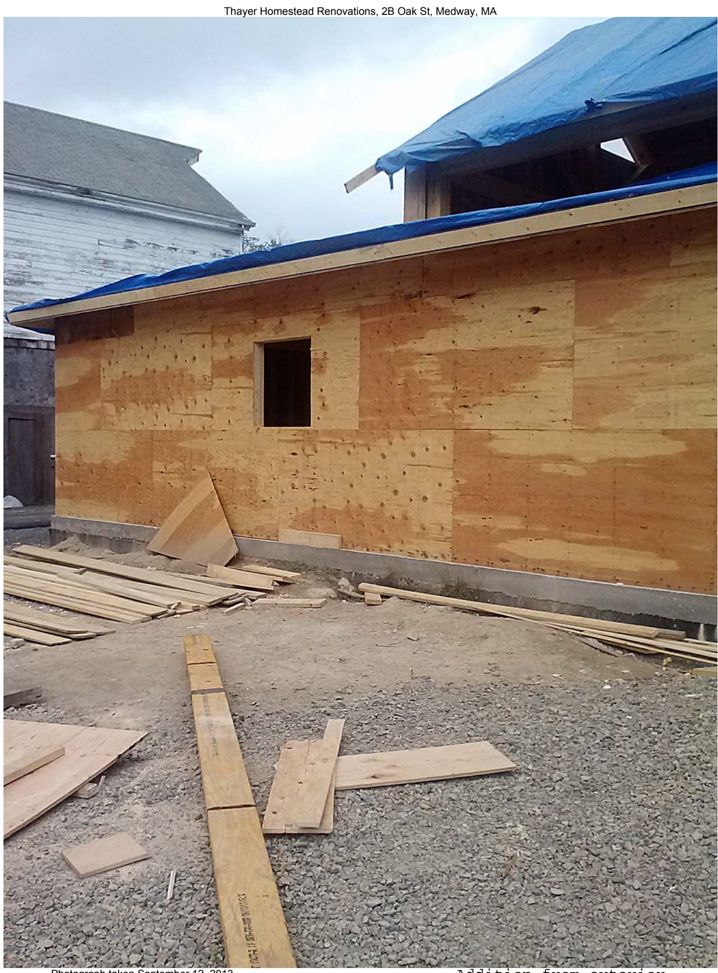
Photograph taken September 12, 2013