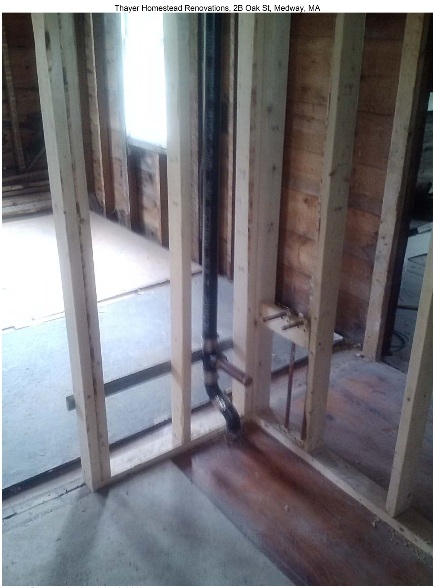
Photograph taken July 11, 2013