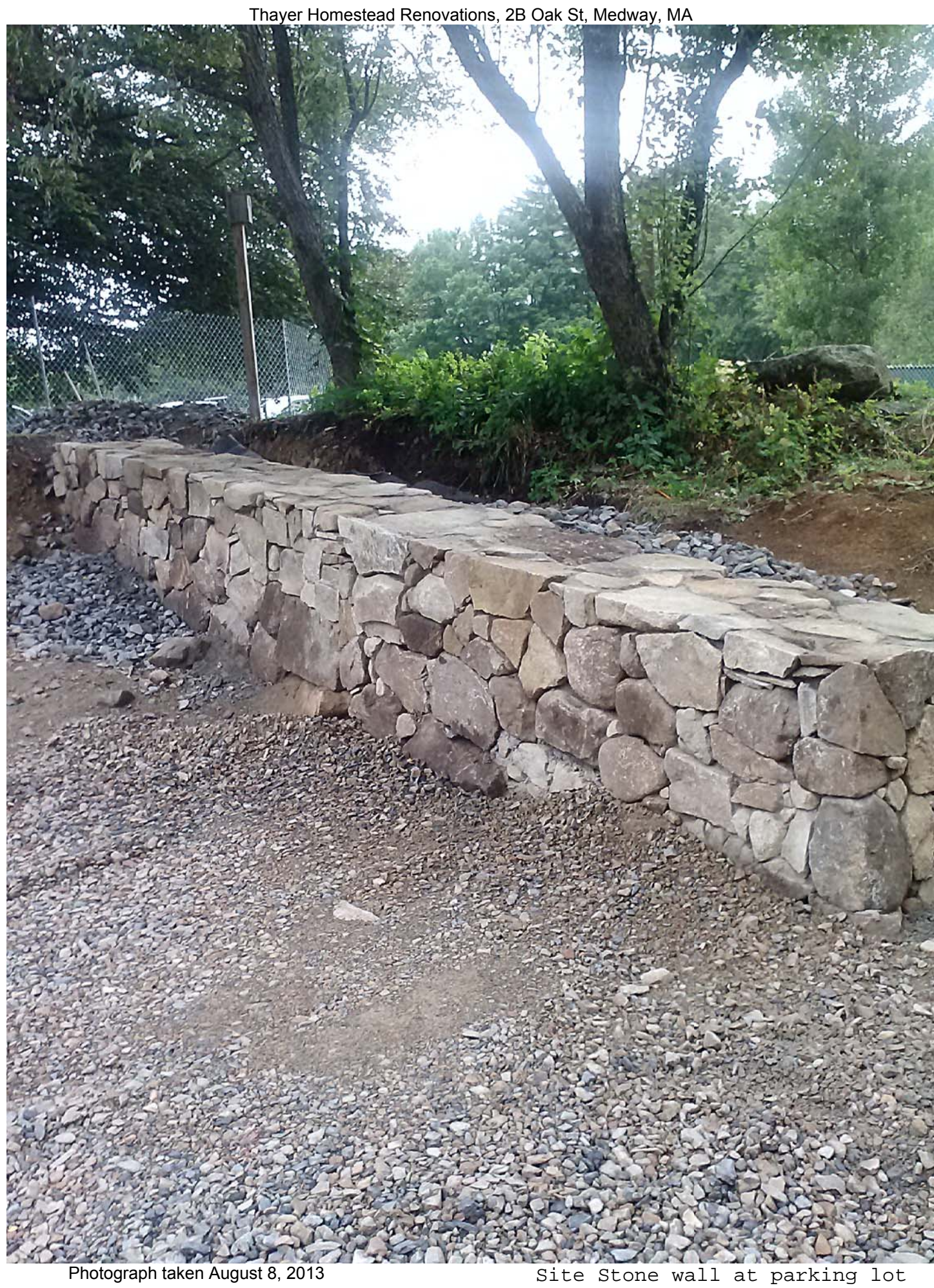
Site Stone wall at parking lot