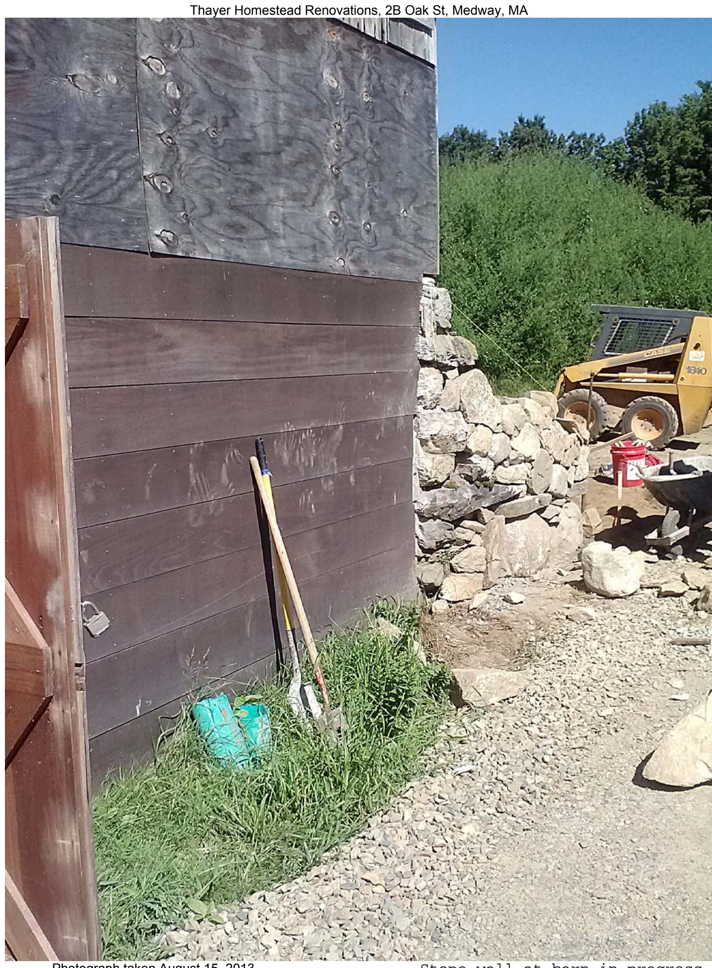
Photograph taken August 15, 2013