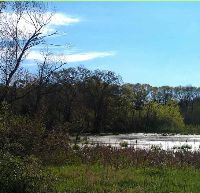
Idylbrook Recreation Area wetlands attract many bird and amphibian species

The Idylbrook trail is a gently sloping nature trail looping around the perimeter of the property. The trail is approximately 0.75 miles in length with a farmer's pond and opportunities to encounter an active beaver dam. To the south of the property, near the Wards Lane parking lot, is a short trail to an active American Chestnut Grove Restoration site and an outlook to a smaller pond and wetlands area.