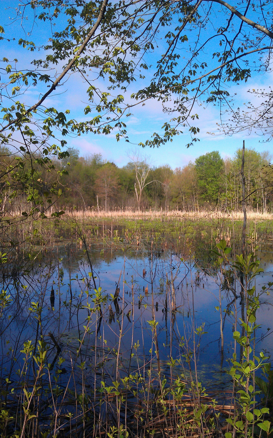
A view across the pond and wetlands at Idylbrook Recreation Area

Wenakeening Woods is owned and maintained by the Upper Charles Conservation Land Trust. There are approximately 3 miles of trail on the 109 acres of gently sloping property.