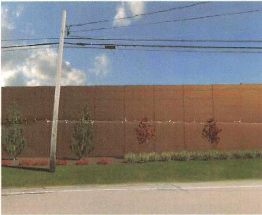
PROPOSED VIEW Generated 2/10/2022