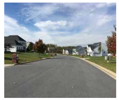
Figure 1. This low-density residential street accommodates two travel lanes and two on-street parking lanes, despite the fact that each house has a three-car garage and large driveway and will rarely if ever need that much on-street parking.

The 22 model development principles and the COW were developed during a time when seminal research on the important connection between impervious cover and stream health had recently been published (CWP, 1998; Schueler, 1994). New suburban development was widespread, and many communities were concerned that their local codes and ordinances created standards that resulted in excessive impervious cover (Figures 1-3). Therefore, the original COW was primarily intended to influence new residential and commercial development and, as a result, most of the COW questions applied to low or medium density (suburban) neighborhoods. The update recognizes that while the overall goals of reducing impervious cover, conserving natural areas and preventing stormwater pollution can apply to any community, some of the COW questions are not relevant for certain types of development. The instructions for using the revised COW explain how to determine which questions are most applicable for the type of development that is most prevalent in your community (e.g., new rural, suburban or urban development, redevelopment).