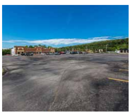
Figure 3. This commercial parking lot sits largely empty because it was not designed for local parking demand.

The COW update also considered revised standards and supporting research on topics such as recommended stream buffer widths, parking ratios, parking stall dimensions needed to accommodate today's vehicle sizes, differing setbacks for fire-prone regions versus humid regions, and the impact of state water law on the use of rainwater harvesting practices.