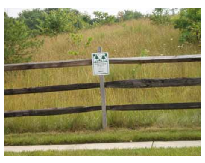
Figure 15. Maryland's unique Forest Conservation Act helps to protect forest from development impacts and required planting new trees at sites where there is little forest to conserve

Conservation and protection measures that require excessive administrative hurdles, such as lengthy plan reviews, additional upfront costs to developers and unclear appeal procedures can create major barriers to implementation. Incentives and flexibility are an effective way to promote adoption of conservation and protection measures.