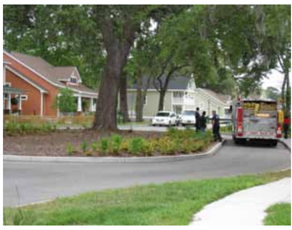
this Savannah, GA neighborhood; yet are wide enough to allow access for emergency vehicles

In many cities and jurisdictions, local street design manuals and standard plans require or incentivize roadways that are overbuilt for motor vehicle traffic, with wide travel-ways and large corner radii that increase impervious surfaces while increasing risk to street users. Revising local street standards to consider design speed, street type and traffic volume presents a significant oppor- Figure 4. Road widths are minimized in tunity to reduce impervious cover, by allowing for more compact roadways and intersections. When curb extensions are permitted, they unlock street space to introduce pervious surface and integrate runoff reduction practices within the street environment.