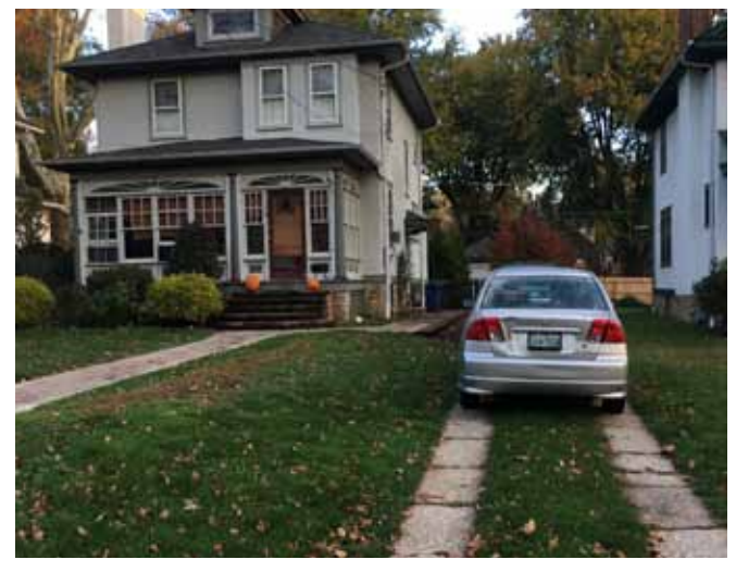
Figure 12. A "two-track" driveway is another way to reduce driveway imperviousness