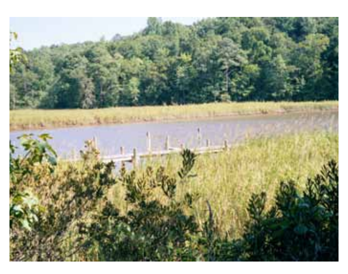
Figure 16. This tidal wetland in coastal Virginia is protected through a setback and buffer, and the adjacent development benefits from the spectacular view and access for recreation.

On the other hand, there are no federal laws that prohibit discharge of stormwater directly into a jurisdictional wetland without pretreatment (Section 404 regulates discharge of dredge or fill material but not stormwater). The definition of what is "jurisdictional" may not include all wetland types or sizes so it is important for local governments to fill this gap in wetland protection. Other types of natural resources may be sensitive to inputs of stormwater and could be better protected by adopting special stormwater criteria. The questions below are intended to address this changing landscape of regulations regarding stormwater discharges to natural areas.