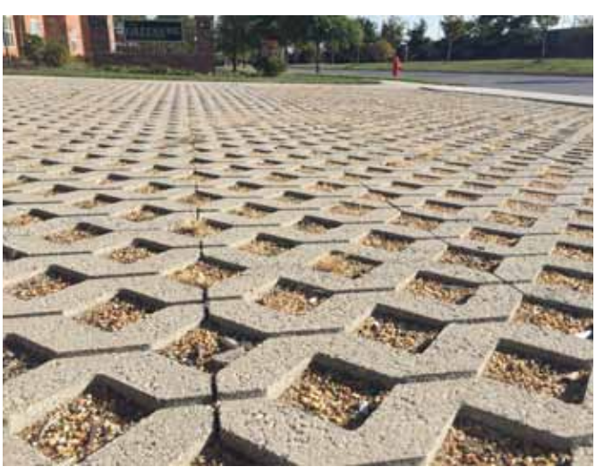
Figure 5. Concrete grid pavers are a good option to reduce runoff from parking lots

Impervious cover can also be reduced through the use of alternative paving materials (e.g., permeable pavement, grass pavers) on regularly used parking stalls and parking lanes as well as in spillover areas for larger parking lots. Most parking codes do not distinguish between regular parking areas that are used most of the time and spillover parking, which is used only a few days per year or for special events. These are ideal locations for permeable pavers, reinforced turf products or other permeable parking options. However, if no distinction is made in the parking code, the result can be creation of enormous paved parking areas that stand empty the vast majority of the year. Communi-