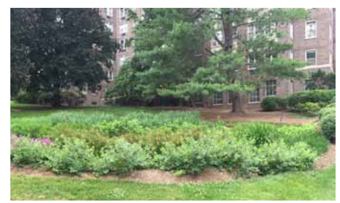
Figure 13. Three options for managing rooftop runoff in Washington, DC: 1) rain barrel, 2) green roof, and 3) disconnected downspout directed to a rain garden