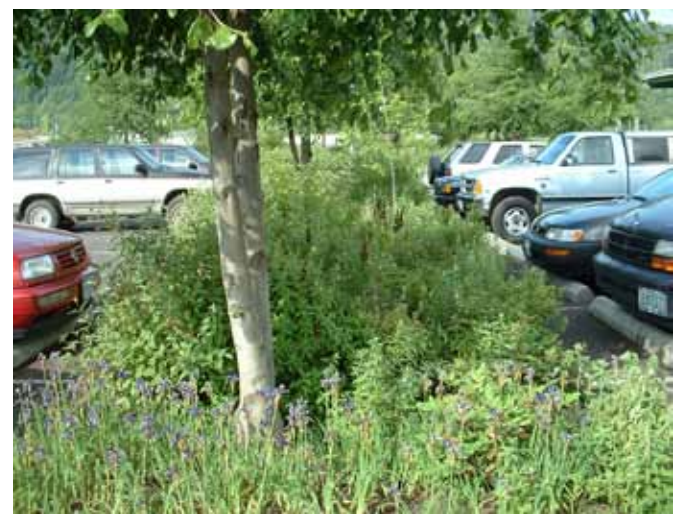
Figure 6. This landscape area is designed to accept and treat stormwater runoff in this Portland, OR parking lot

Another option is to plant large trees within the landscaped areas due to their ability to reduce stormwater runoff, promote infiltration, and take up nutrients and other pollutants. A minimum width of 6 feet is recommended to support large, mature trees (Cappiella et al, 2006). Layouts that cluster trees and allow them to share rooting space are also encouraged. Lastly, even the paved portion of the lot can provide stormwater treatment through the use of per-