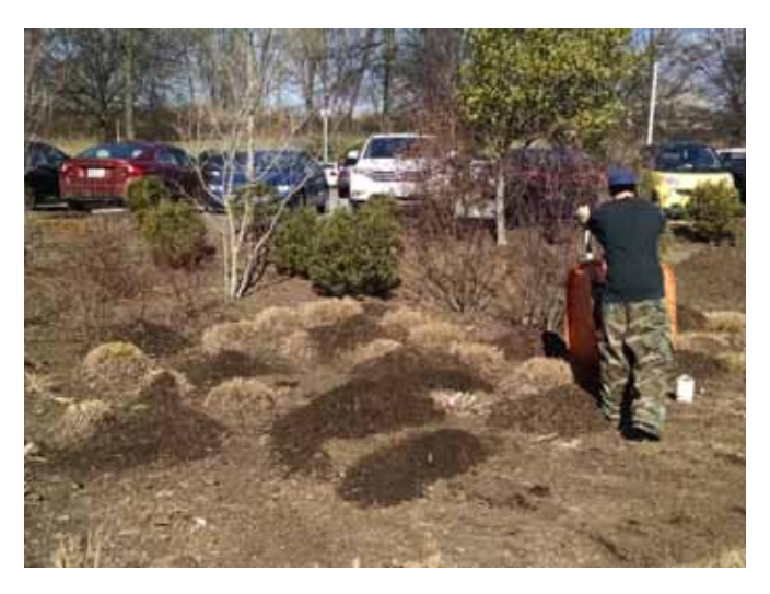
Figure 17. Mulch replacement is one activity that may be included in a maintenance agreement for stormwater practices such as bioretention.

Installation and maintenance can be the "Achilles heel" of stormwater practices, especially small-scale runoff reduction practices. Many practices have failed due to these issues, and thus are not providing the hydrologic and water quality benefits they are intended to provide. For construction and installation, it is critically important that erosion and sediment control standards are integrated with the post-construction stormwater plan. For instance, areas designated for post-construction stormwater control must be protected from heavy equipment, compaction, and sediment during construction, especially if the postconstruction practice will rely on infiltration or soil treatment. Post-construction practices, such as filter strips and riparian buffers, should be outside of the limits of disturbance during active construction. Performance bonds are important tools to ensure that installations are completed as per the approved plan.