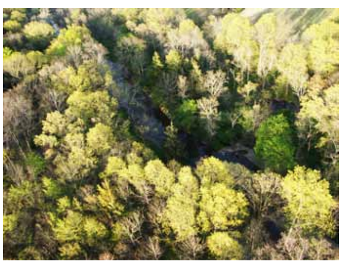
Figure 14. A forested buffer on either side of the stream helps to protect water quality and habitat

Vegetated systems along shorelines, wetlands, and streams can protect water quality, reduce flooding impacts, provide wildlife habitat, serve as a recreation resource, and offer economic benefits to the local community. Optimal buffer widths vary with the type of waterway and the desired benefit (e.g., water quality protection versus habitat).