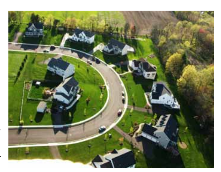
Figure 9. The roadway comprises a significant portion of impervious cover in this neighborhood, compared to sidewalks

The intent of this principle is to ensure that sidewalk design standards for residential areas are flexible and do not result in excessive impervious cover. While locating sidewalks on only one side of the street may be appropriate in some rural neighborhoods, sidewalks represent only a small proportion of total site impervious cover (from 1% to 7% of total impervious cover, depending on density, based on analysis of data from Cappiella and Brown 2001). Therefore, communities may get more "bang for their buck" by focusing on reducing roadway widths rather than eliminating or reducing sidewalk widths to reduce impervious surfaces while at the same time achieving better safety and mobility outcomes.