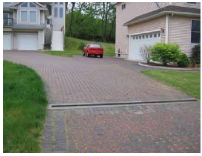
Figure 11. This shared driveway in Jordan Cove, CT helps to reduce impervious cover and is also constructed using permeable materials.