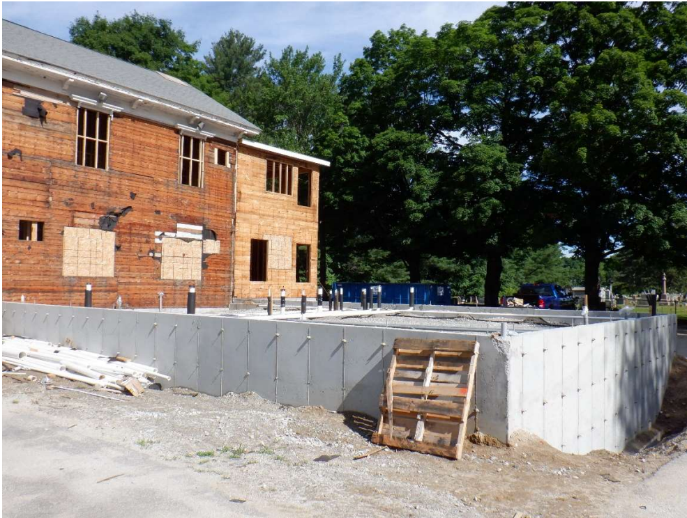
Building addition piping