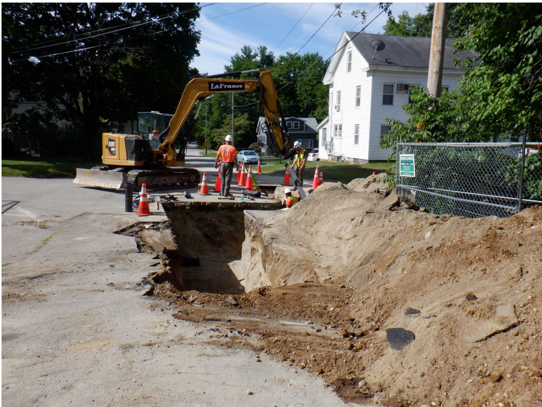
Water main extension through Cutler Street