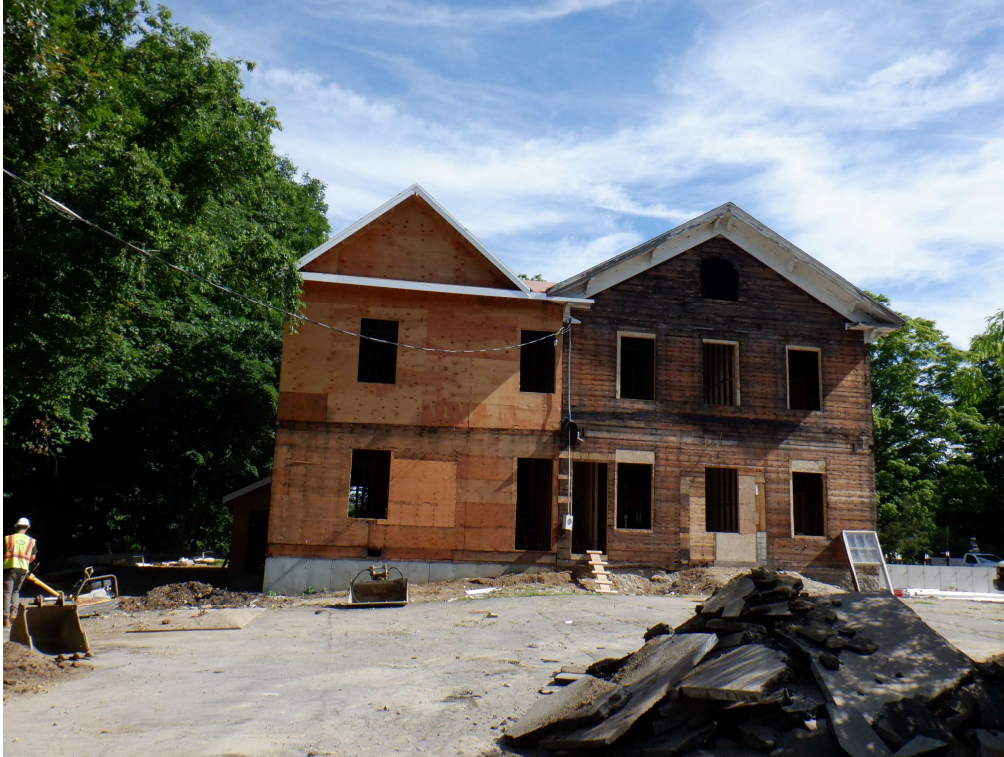
Left side enclosed and roofed