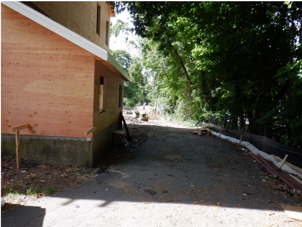
Erosion control maintained