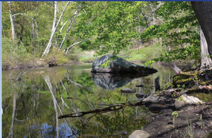
Swimming Rock at Amphitheatre

Small pond off of Deerfield Street, across from 20 Deerfield Street. On street parking only. Short trail and benches.