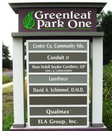
Figure 2: Sign is appropriately scaled for the business' customers coming by automobile