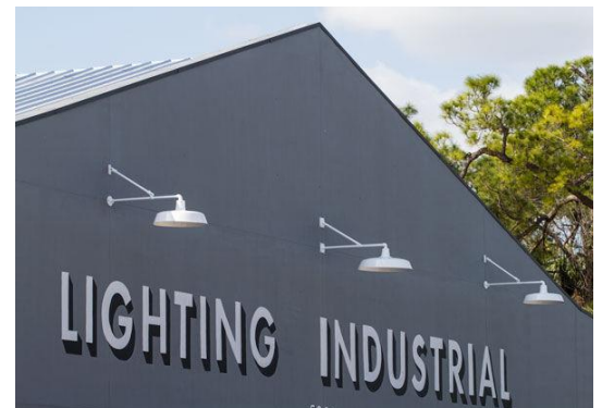
Figure 7: External lighting fixtures that project light onto the sign are strongly encouraged