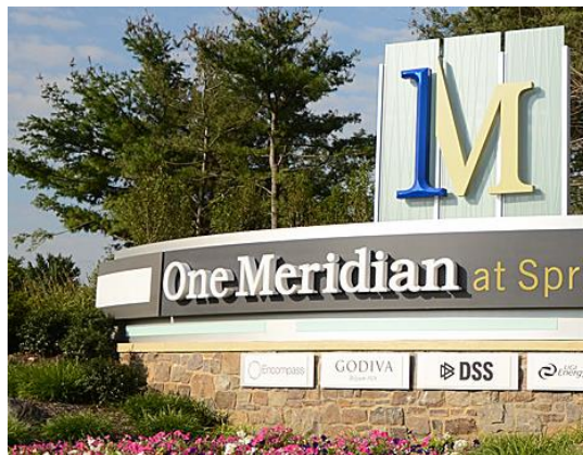
Figure 1: Hierarchy of signage clearly displays the most important information in the largest text sign