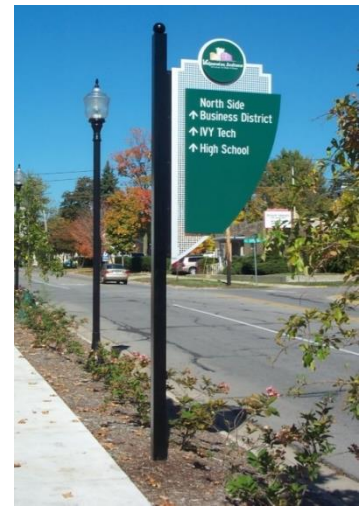
Figure 4: Wayfinding signs can help guide visitors to their destination