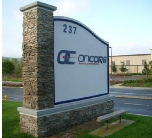
Figure 3: Sign is integrated into landscape and reinforces project entry point