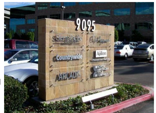
Figure 6: Sign is consistent with site architecture and provides information on the multiple tenants in the site area