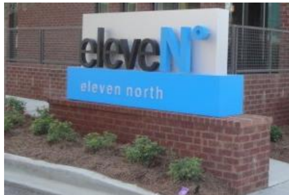
Figure 5: Sign design integrated with building and placed to mark a building entry point