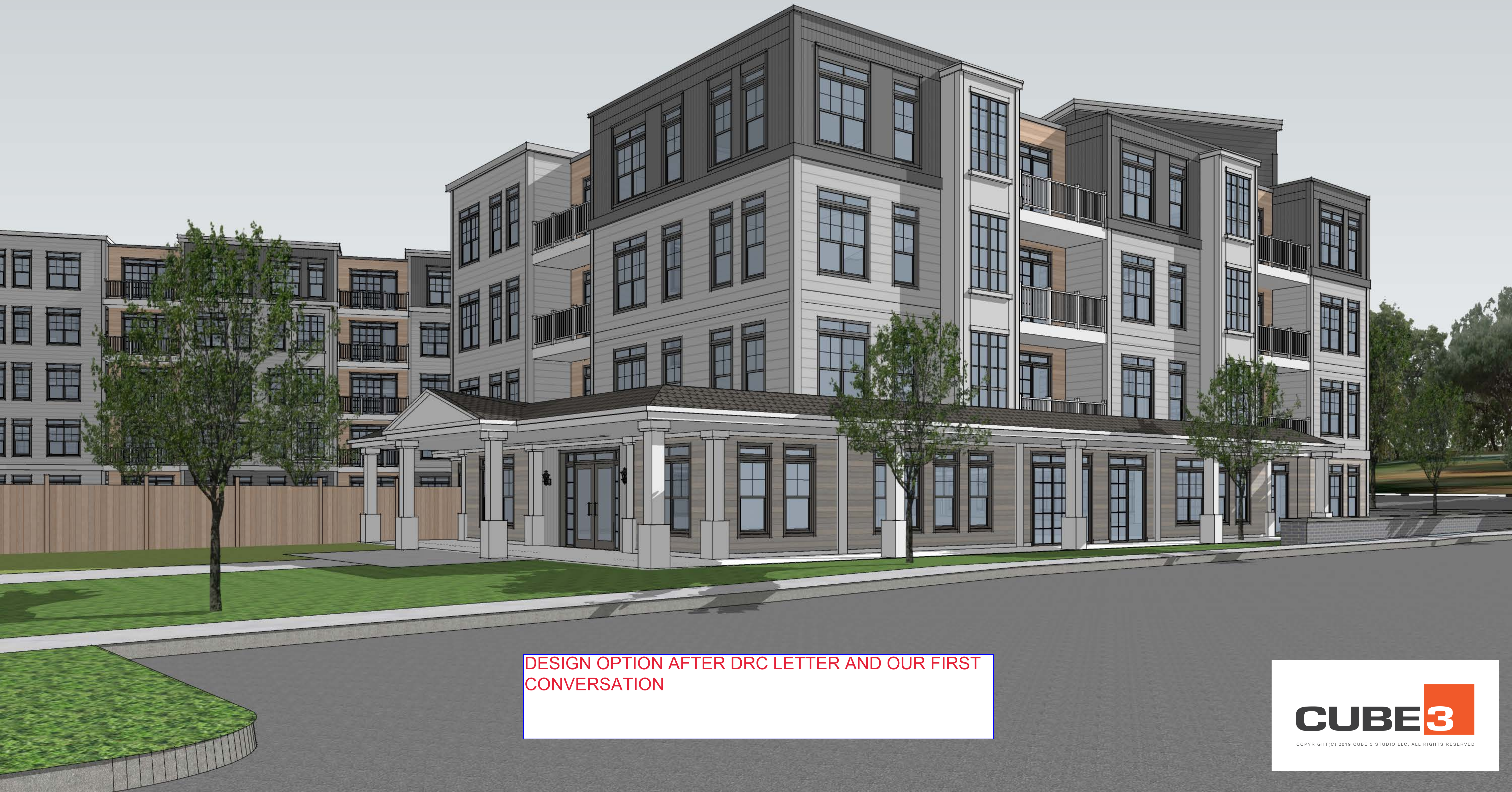
DESIGN OPTION AFTER DRC LETTER AND OUR FIRST CONVERSATION