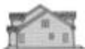
RIGHT SIDE ELEVATION 12'-0"