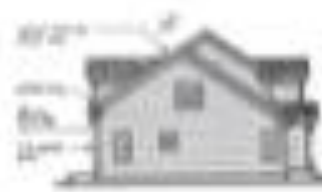
REAR ELEVATION 30'-0"

NOTE: ALL DIMENSIONS ARE IN FEET CLARE ARCHITECTS P.O. BOX 100 T.P.