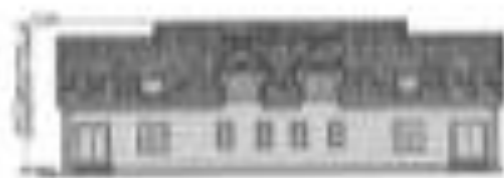
LEFT SIDE ELEVATION 30'-0"