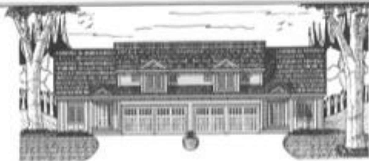
FRONT ELEVATION 30'-0"